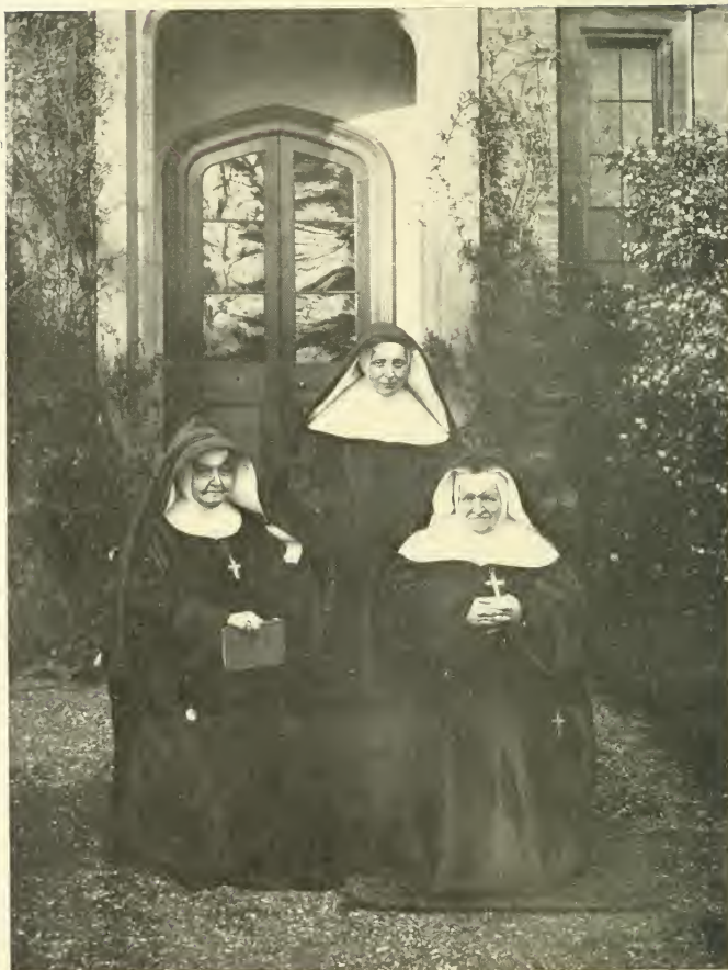
The Lady Abbess of Oulton.