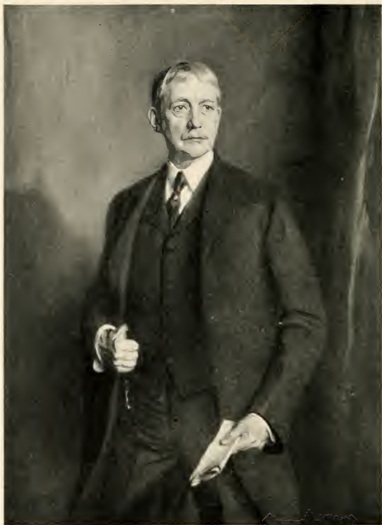
Portrait by Philip A. de László.