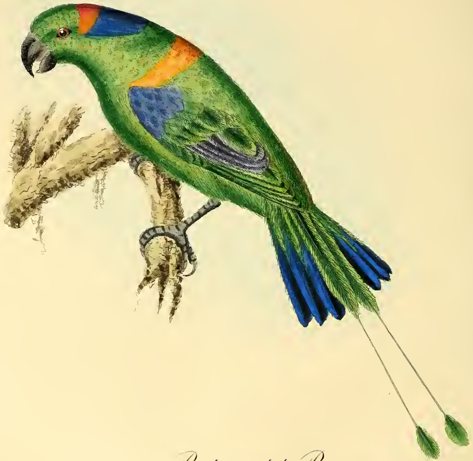
Racket tailed Parrot.