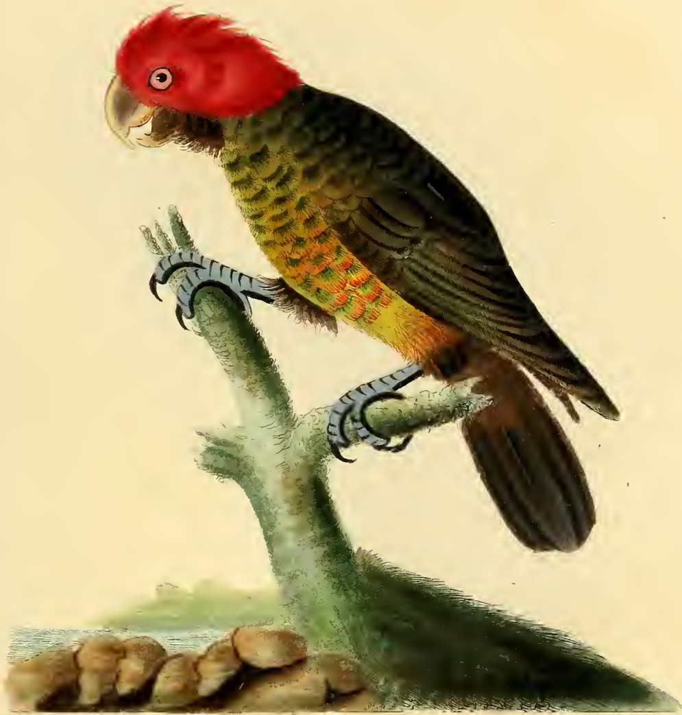
Red Crowned Parrot.