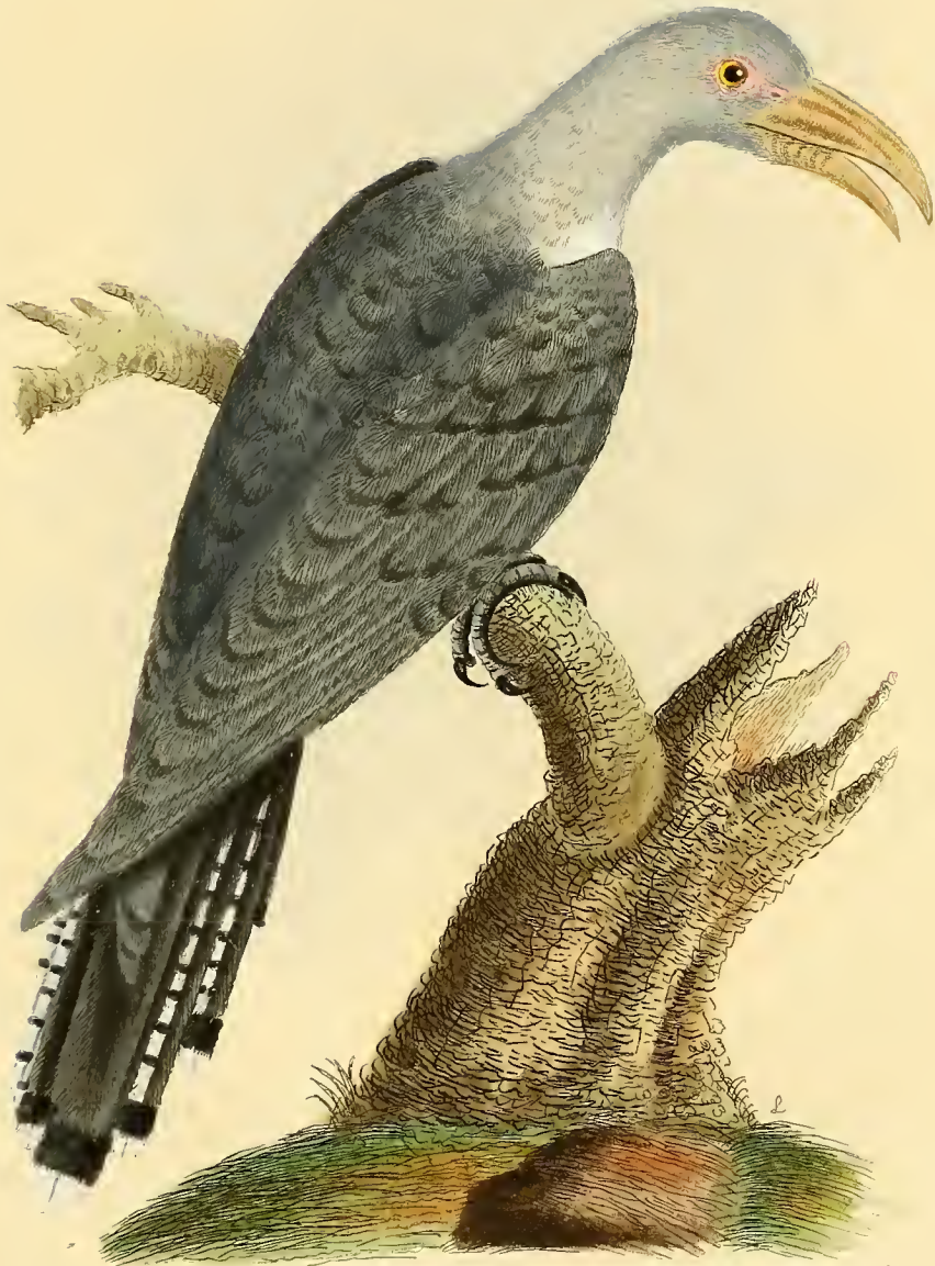
New Holland Channel-Bill