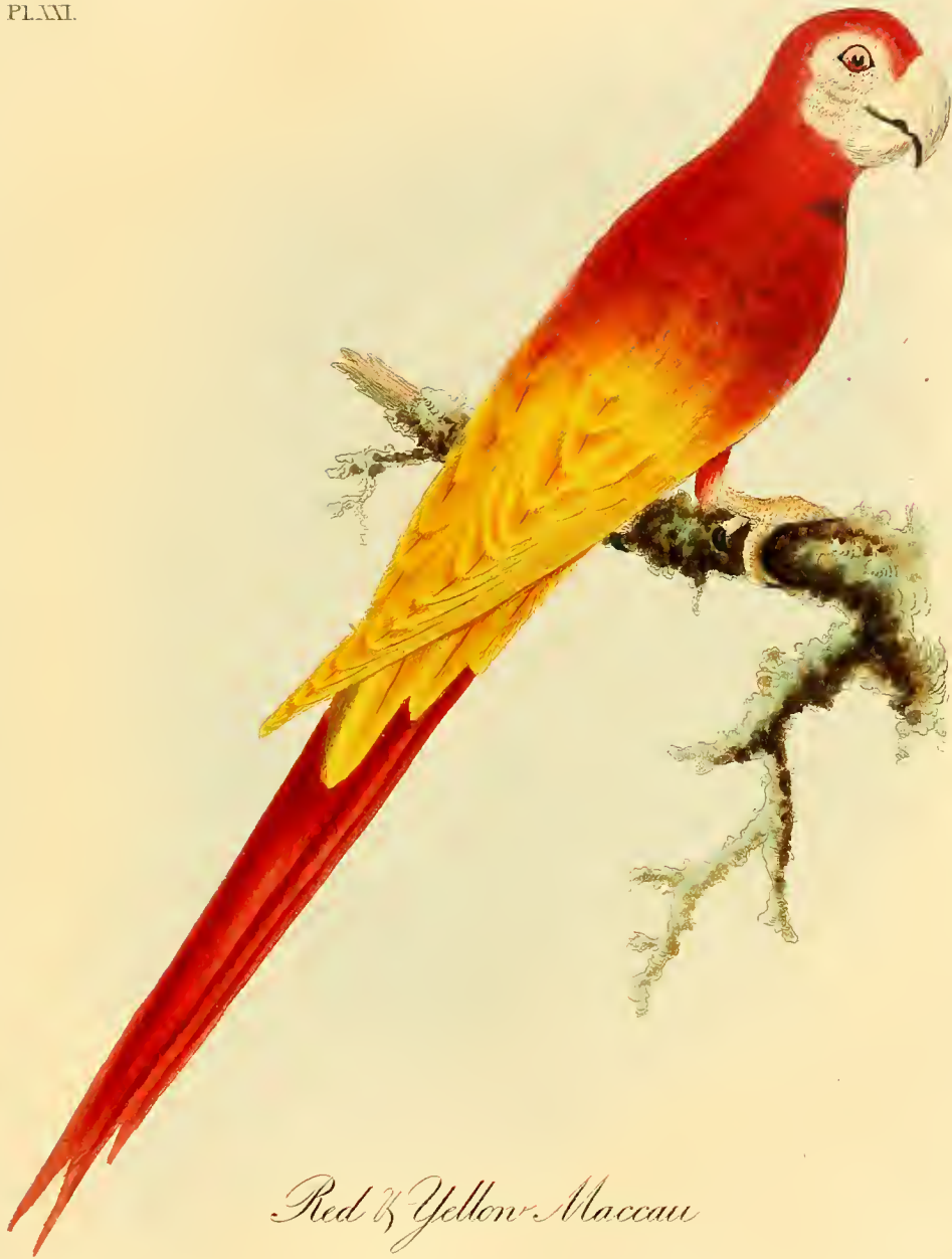
Red & Yellow Macaw