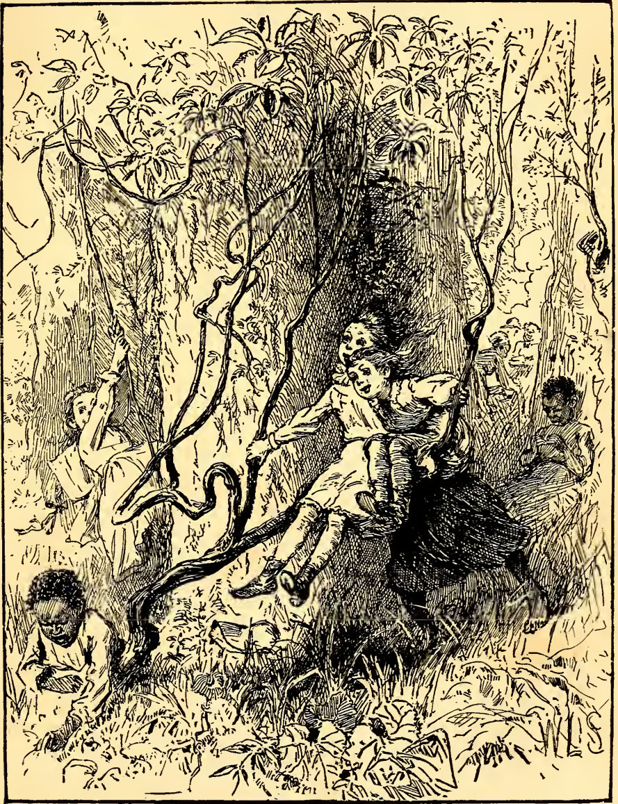
"SWINGING ON GRAPE-VINES AND RIDING ON SAPLINGS."