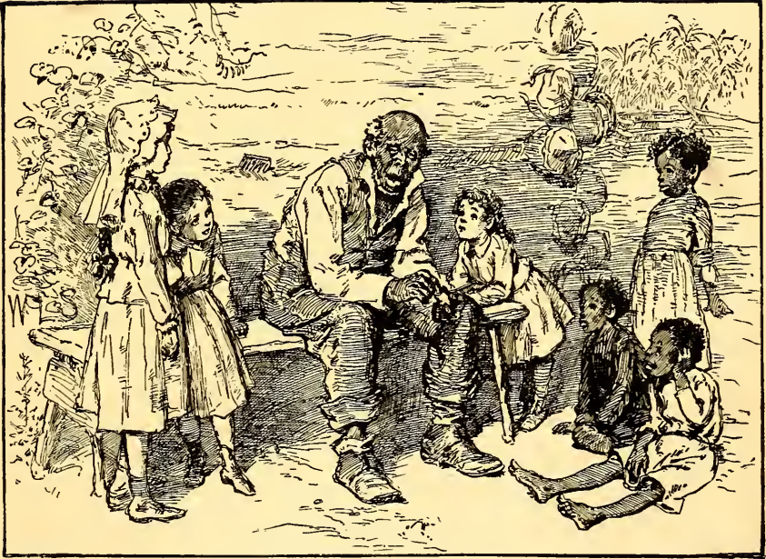
“STRUCK’N UV DE CHIL’EN.”