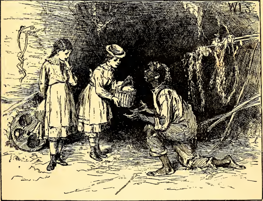
“BRINGIN’ ’IM THE PICNIC.”