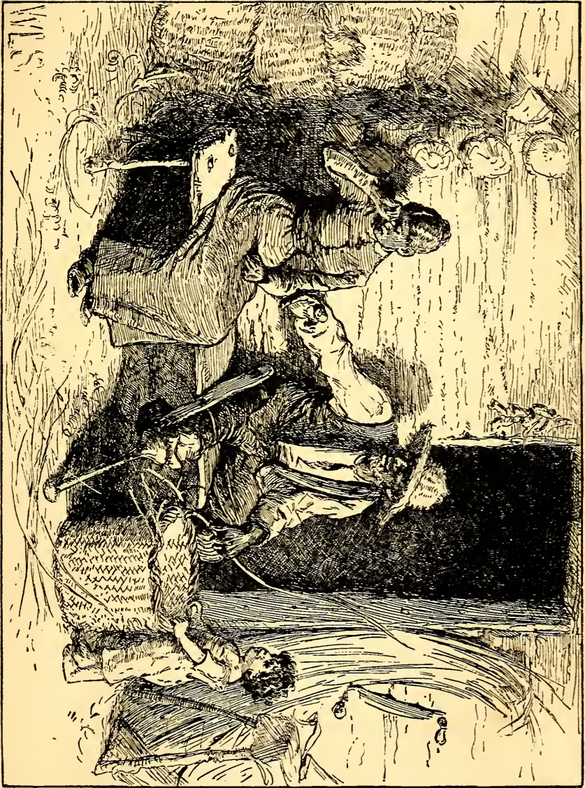
"MY MIN' HIT'S MADE UP."