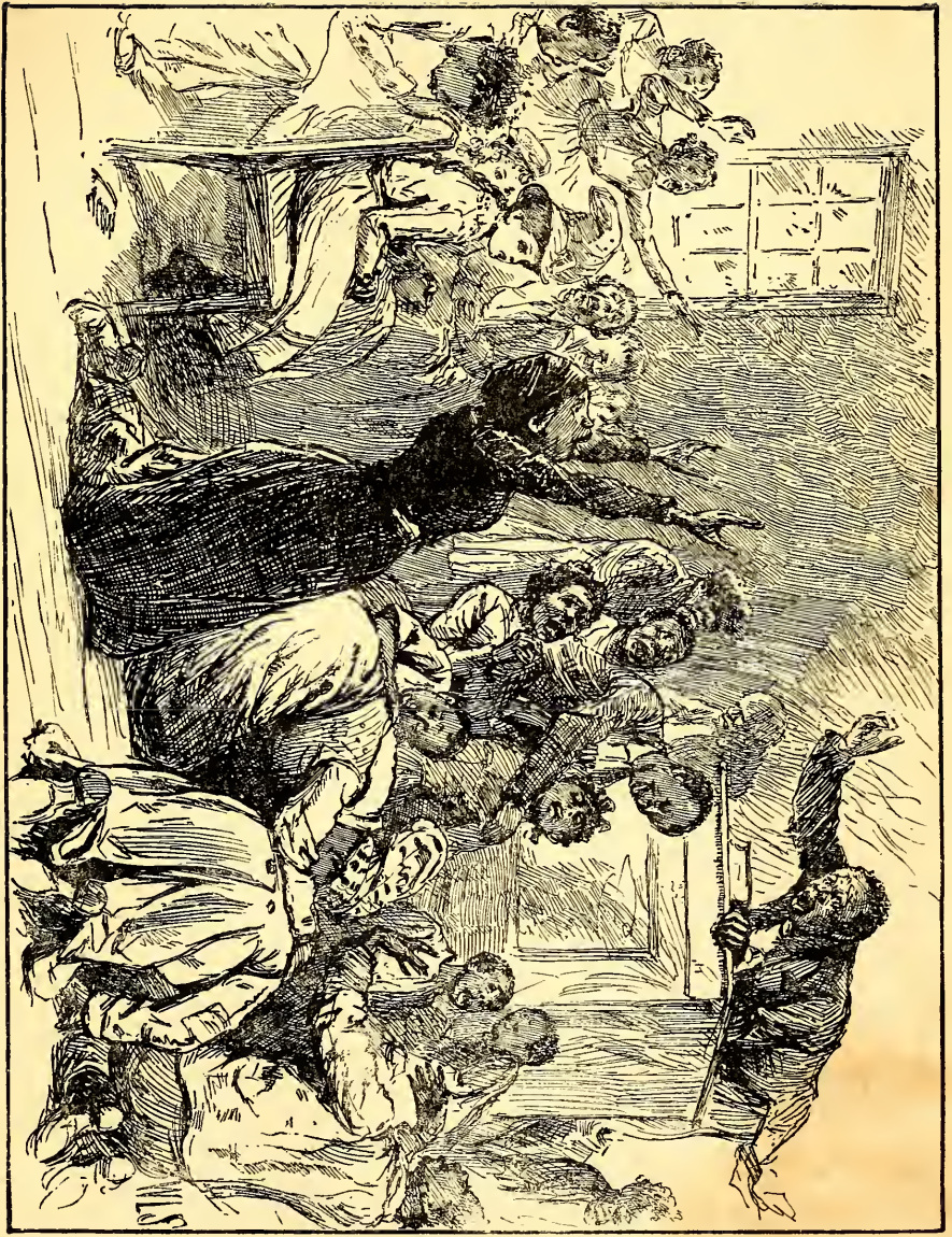
“MONAHS 'PUN TOP ER MONAHS.”