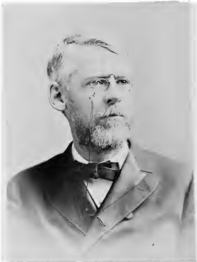
HON. WILLIAM E. CHANDLER.