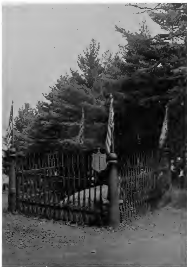
WEIRS MEMORIAL STONE.