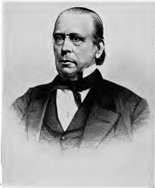
GOVERNOR NATHANIEL S. BERRY.