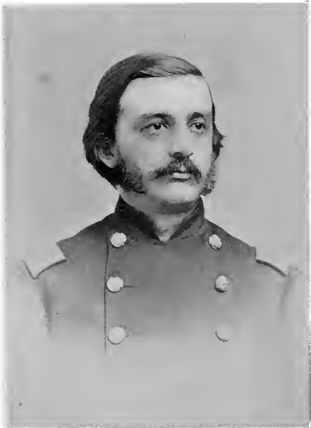
COL. HENRY O. KENT. Colonel 17th New Hampshire Infantry.