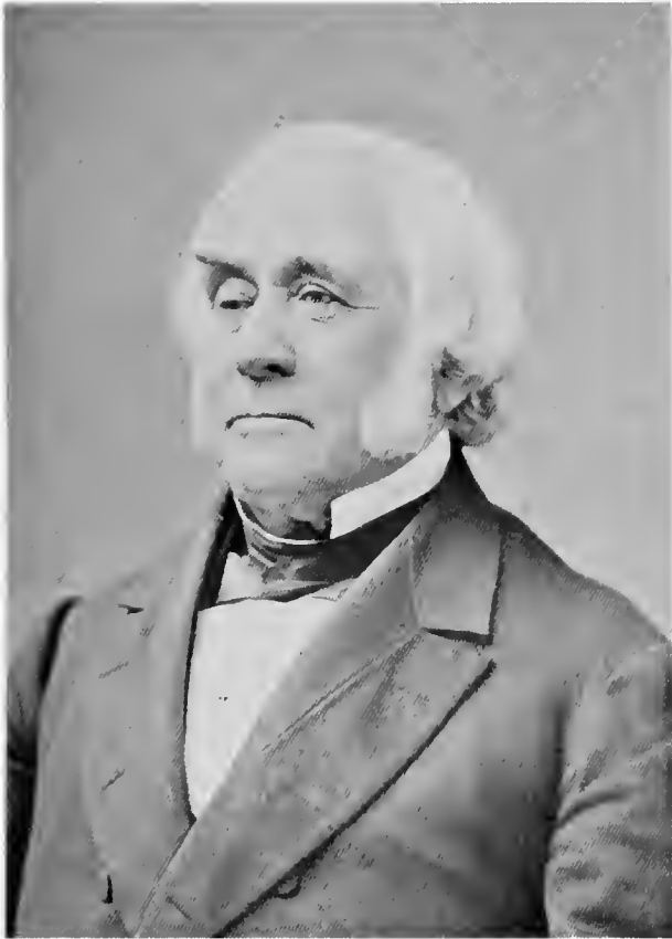
GOVERNOR ICHABOD GOODWIN.