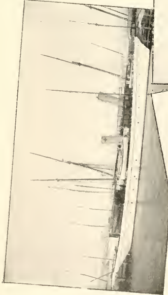
Yacht "Red Cross."