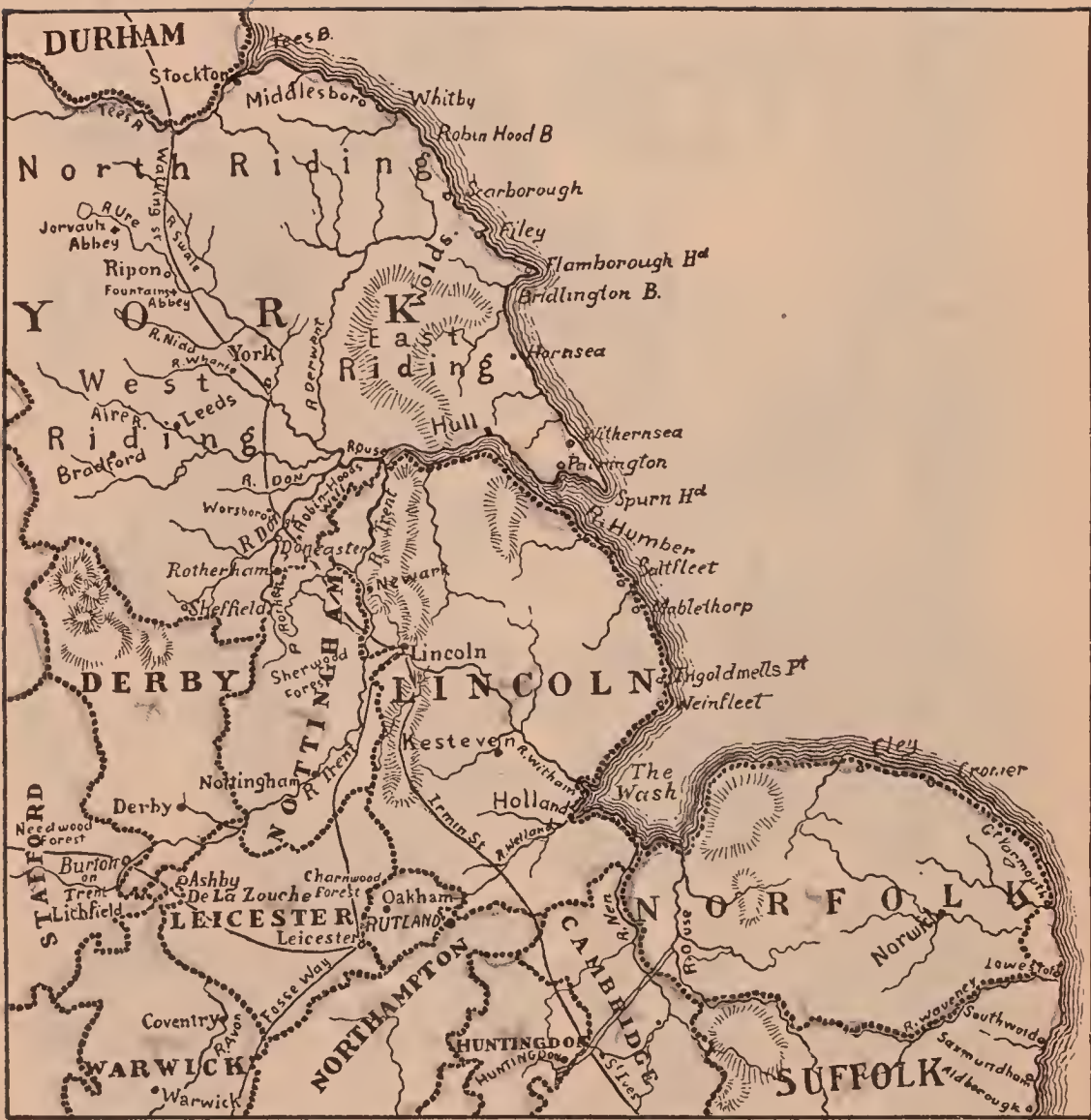
MAP OF THE NORTHEASTERN PART OF ENGLAND

Where the leading events of Ivanhoe are supposed to have taken place.