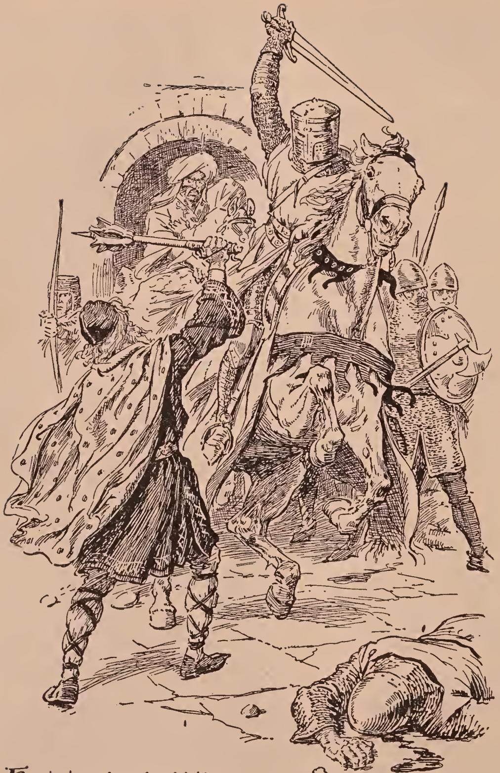
He discharged a fearful blow upon the head of Athelstane