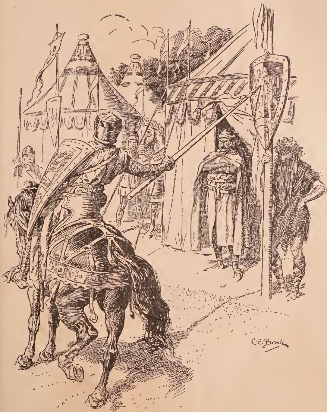
Struck with the sharp end of his spear The shield of Brian de Bois-Cuilbert