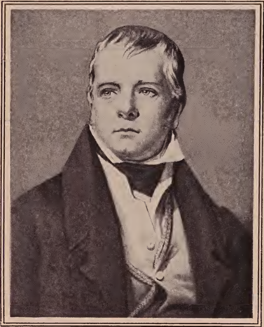
SIR WALTER SCOTT