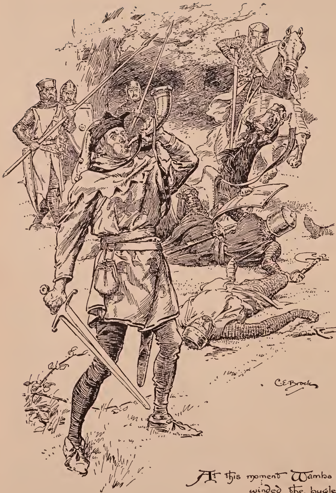
At this moment Wamba winded the bugle