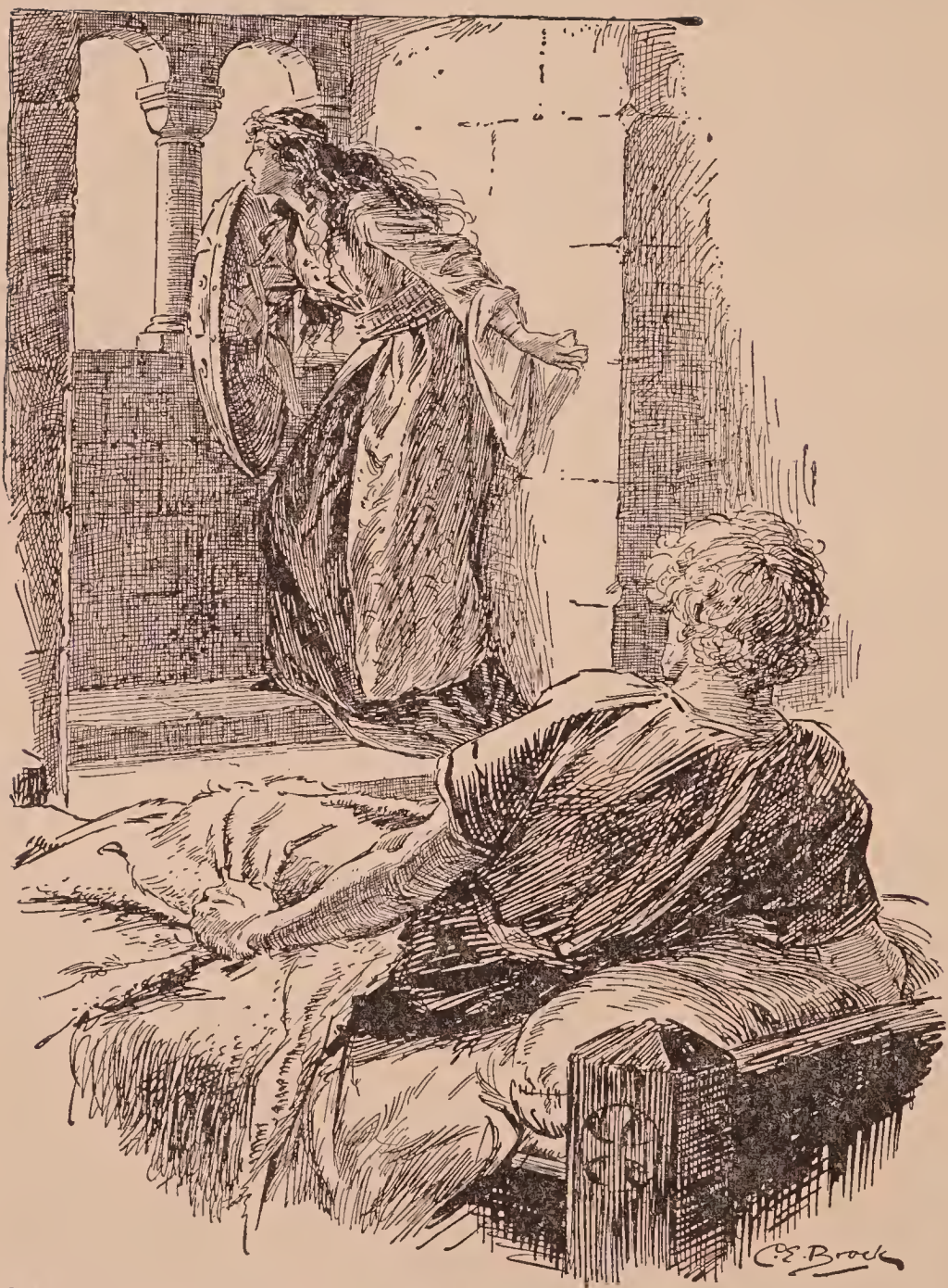
Availing herself of the protection of a large ancient shield