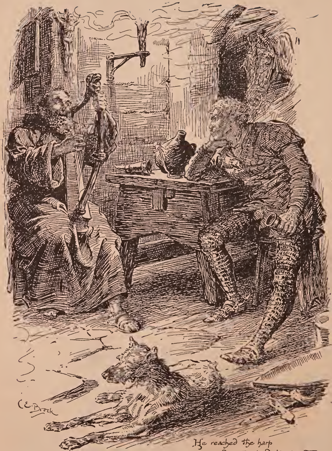
He reached the harp and entertained his guest