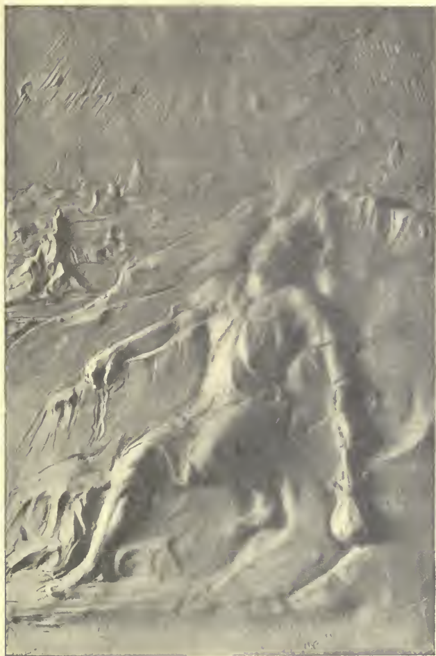
THE LAST CHANTEY