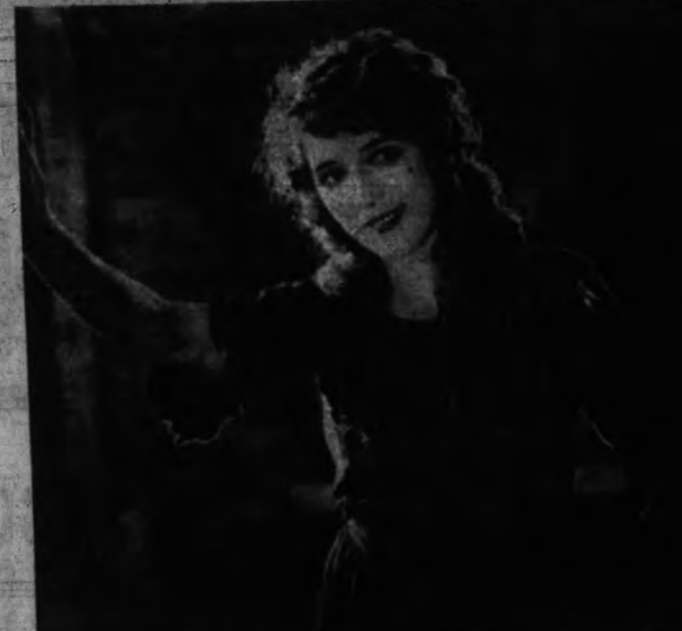
Mary Pickford in "Little Annie Rooney" at the Dominion this week.

Music, Thursday Evening and Saturday Afternoon.