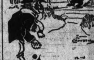
Tommie Kat stood in the doorway.

Inside, the bunny expected to see Mrs. Kat, as well as the other