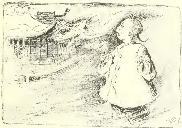
BO-BO PLAYETH WITH FIRE.