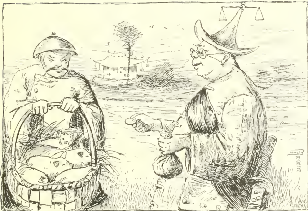
YE JUDGE SPECULATETH.