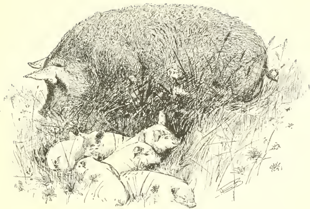
YE DELIGHTFUL FIG.