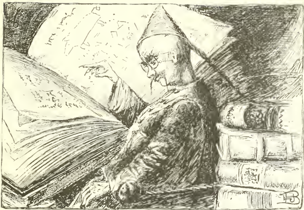
YE SAGE MAKETH A DISCOVERY.