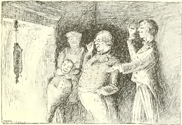
YE PIG TWIRLETII.