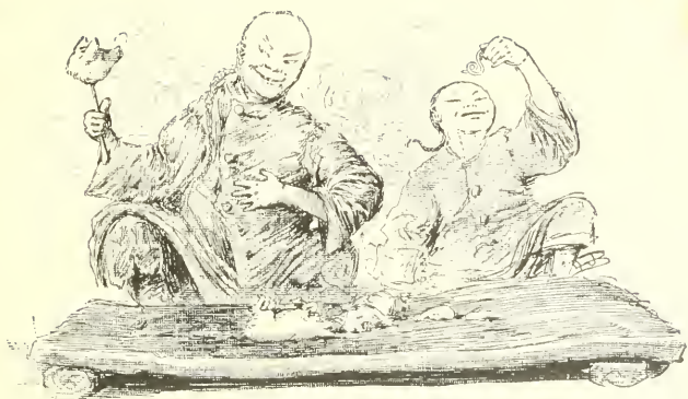
YE FAMILY REJOICETH.