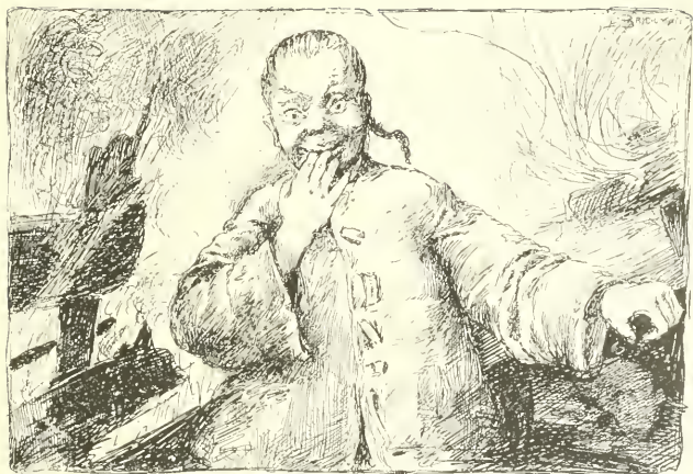
YE FIRST TASTE.