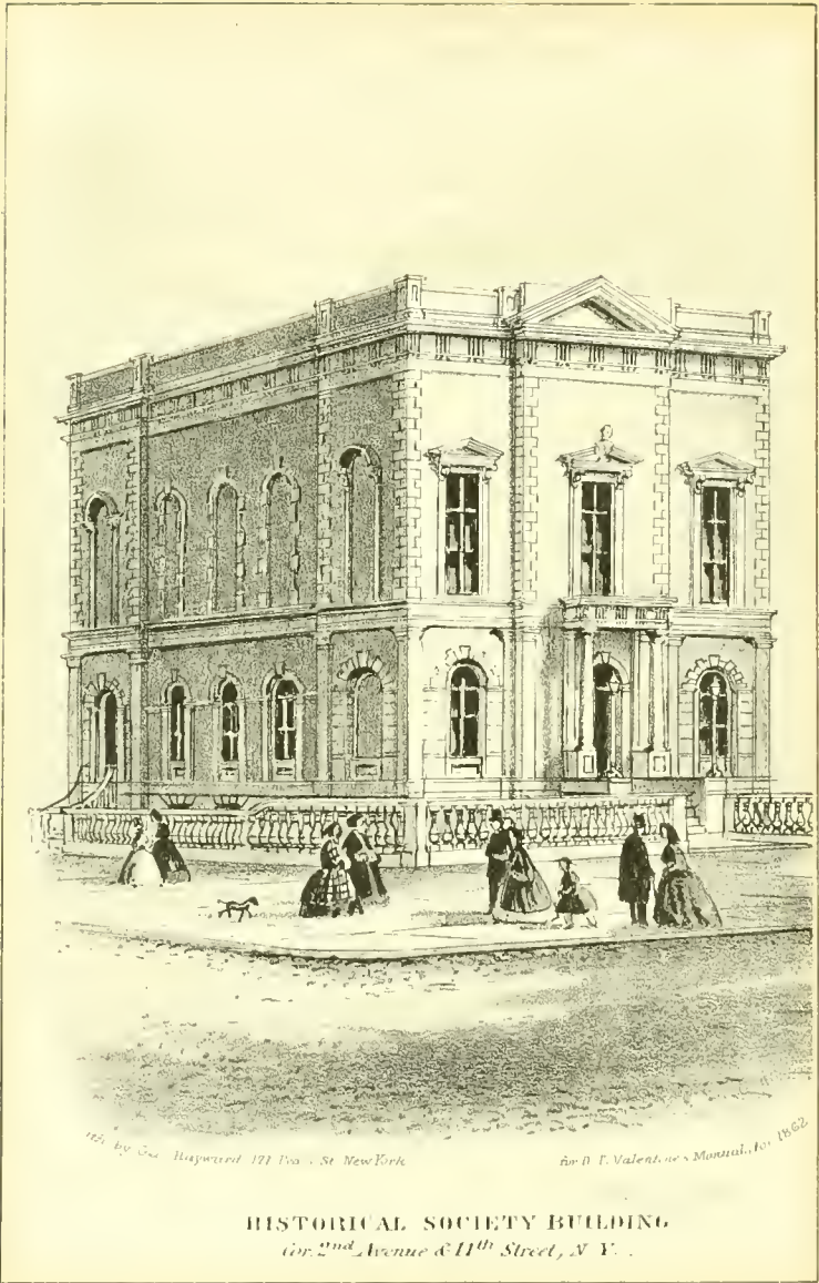
HISTORICAL SOCIETY BUILDING (on 2 nd Avenue & 11 th Street, N. Y. .