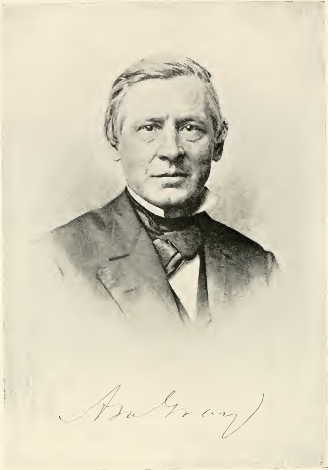
DR. ASA GRAY 1867