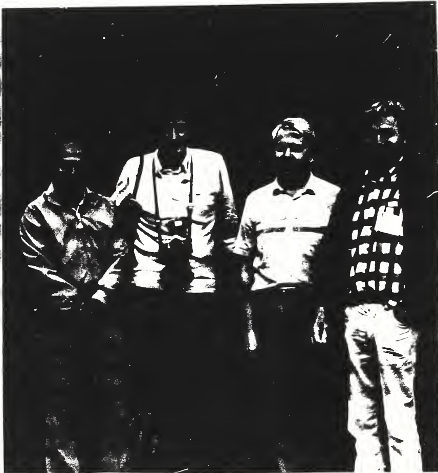
Four well known workshop participants (from countries without fire blight) at the 4th International Fire Blight Workshop in Ithaca, New York (June/1985): (left to right)