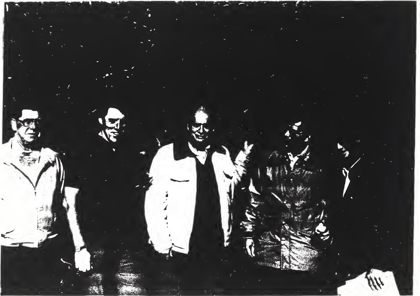
The five Appalachian Fire Blightketeers from the four states in the mid-Atlantic region: (left to right)