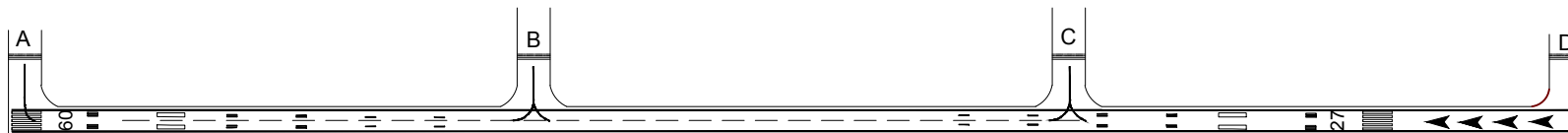
ILUMINACION RWY 09/27 Y SALIDA TWY - LIGHTING RWY 09/27 AND EXIT TWY