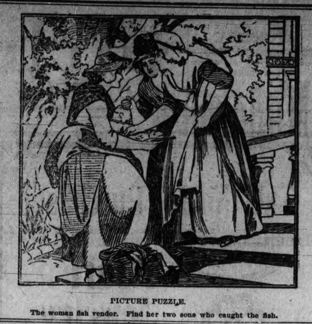
PICTURE PUZZLE. The woman fish vendor. Find her two sons who caught the fish.