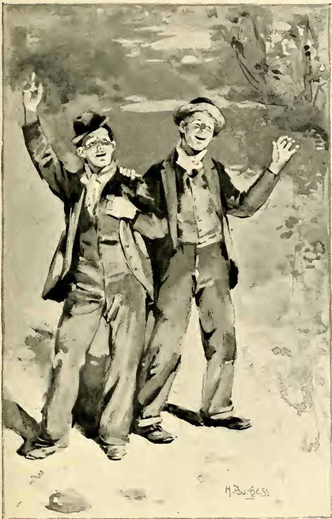
"THE TWO COUNTERFEIT REVELLERS." Page 48.