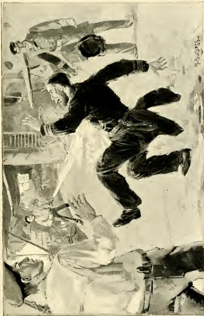
"THE STREAM STRUCK THE COMMANDER WITH FORCE," Page 331.