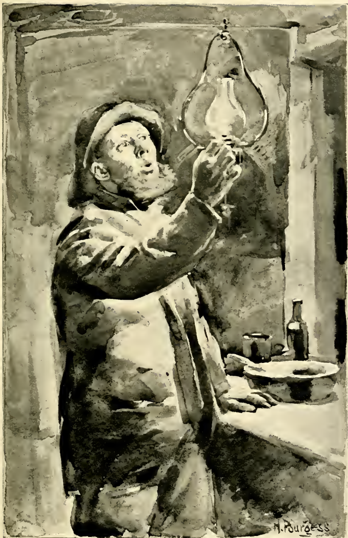
“DOWSE THAT GLIM IN YOUR FO’CASTLE.” Page III.