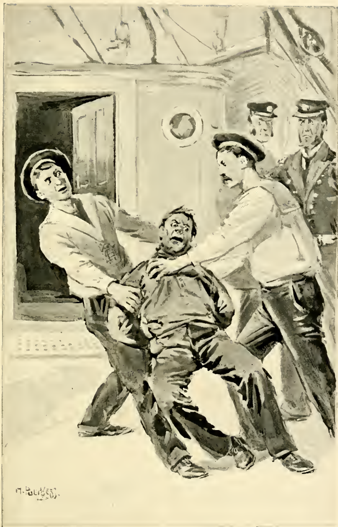
"CAPTAIN SULLENDINE WAS DRAGGED BELOW." Page 238.