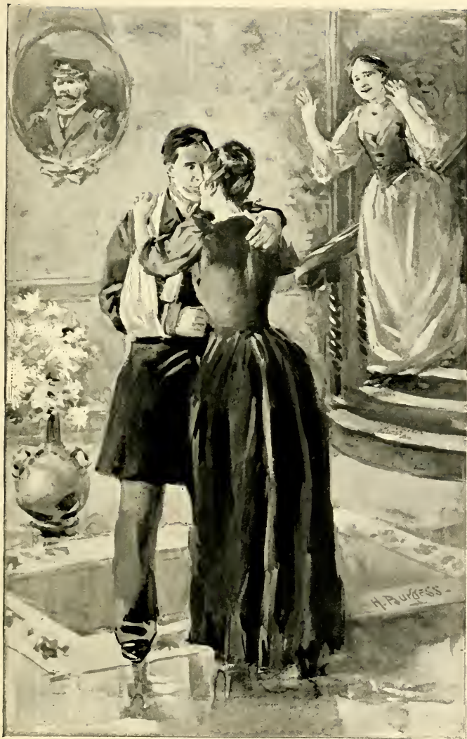
"MRS. PASSFORD RUSHED DOWN THE STEPS." Page 264.