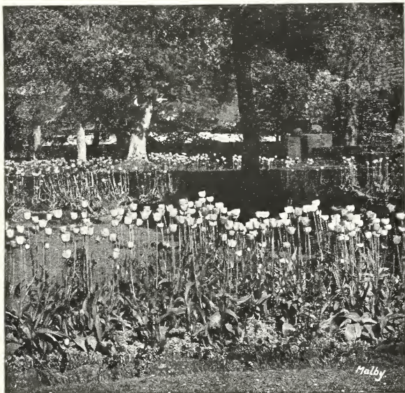
A Darwin Tulip Garden

T HE Growers from whom I have reserved the season's choice bulbs have my explicit instructions to ship nothing but the finest grades the crop affords. I pay a premium for these specially picked stocks and my prices are governed by their superior quality. As many of the varieties listed are very scarce it is advisable to order early so as to secure full delivery.