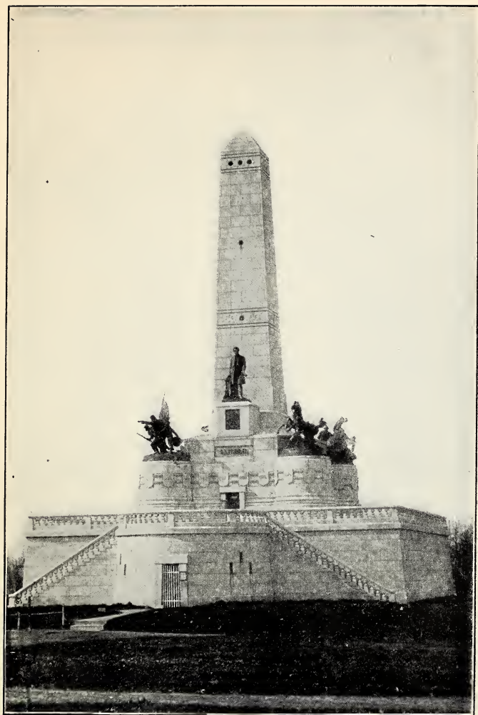
Lincoln Monument, Springfield, Ills. Erected after the Design of Larkin G. Mead.