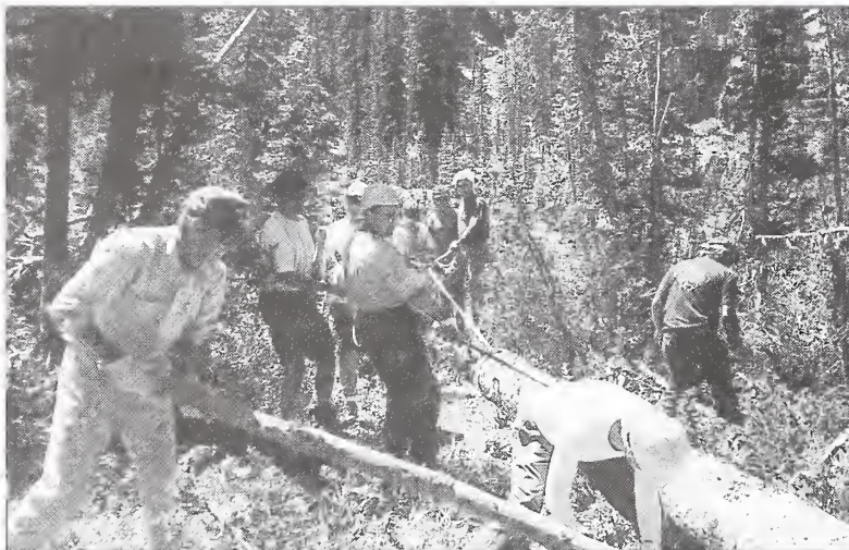
American Hiking Society volunteers move a log for bridge support on the Teton Creek Trail.