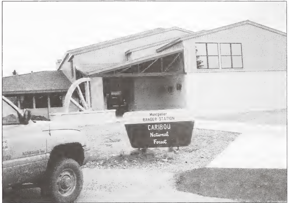
The new offices of the Montpelier Ranger District. The right side of the building is the Oregon-California Trail Museum and the left side is the Ranger Station. The landscaping will be completed in spring, 1998.

Through contracts approved in the Regional Office, the Montpelier RD Office is now located in the new Oregon California Trail Museum on the grounds of the Wells C. Stock Park. The location is terrific for customers, the income from the Forest Service lease is helping support the Museum and ease the burden on the community, and the office space is much more conducive to employee efficiency and