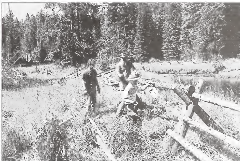
Partnership with Trout Unlimited accomplishes fence mending on the Payette NF.