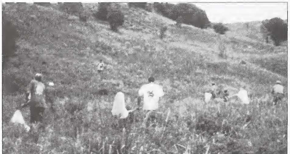
Participants use nets to sweep for Aphthona nigriscutis beetles in Black Canyon. They are collecting beetles from the existing insectory to transport to a patch of leafy spurge and start a new insectory.