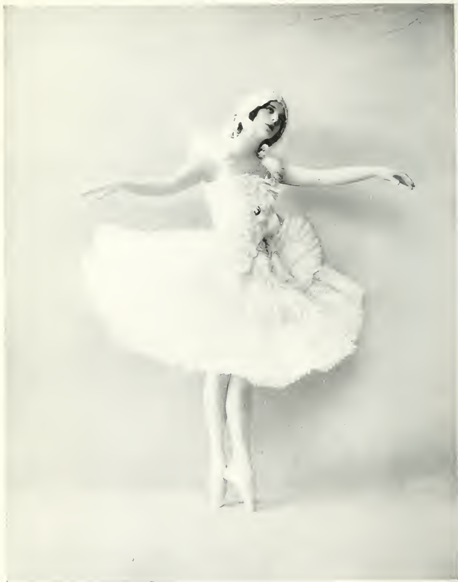
ANNA PAVLOVA in "The Passing of the Swan." "She takes a collection of steps as a singer takes a collection of notes, and calmly and gracefully phrases them, in the manner of a bird beating the air with its wings"