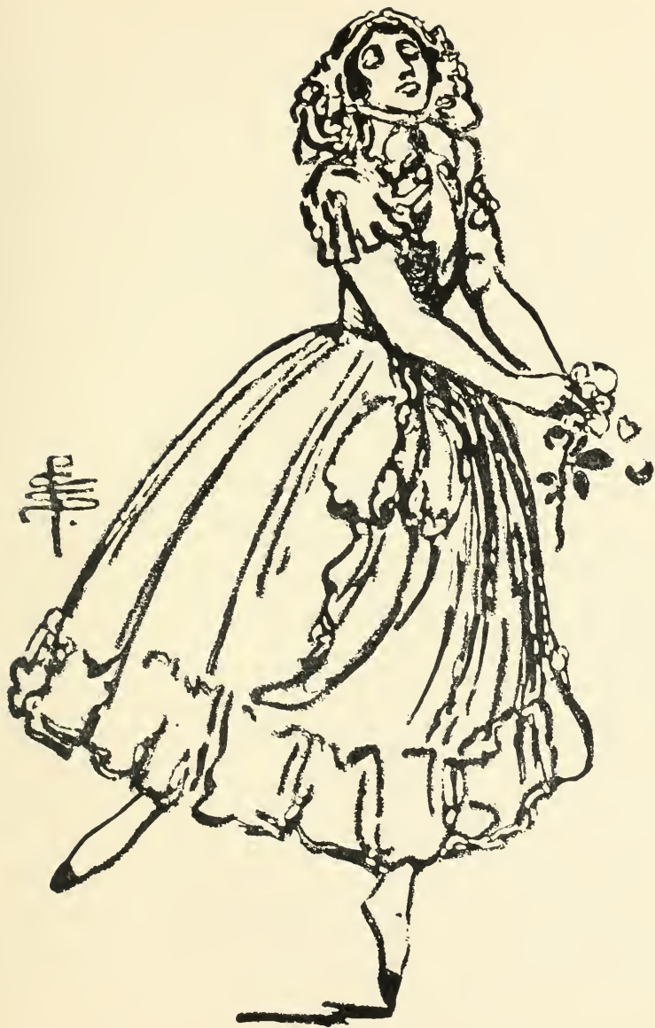
SPECTRE DE LA ROSE