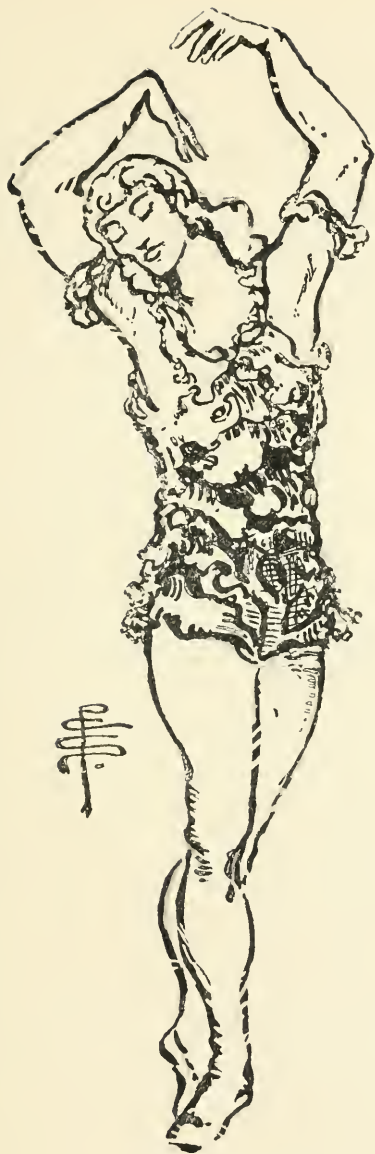
SPECTRE DE LA ROSE