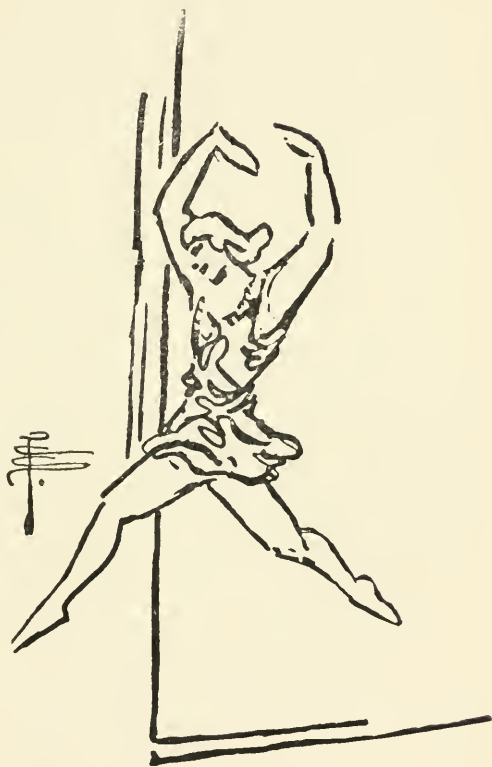
SPECTRE DE LA ROSE

tween the things talent and genius lie if not in the huge personality of the genius? They used to say of Henry Irving, who expressed himself in a multiplicity of parts, that he was always the same Irving. Certainly he was always faithful to himself whatever he assumed. This is a sign of the presence of genius, not of its absence. In one sense we always have the same Nijinsky, as Miss Pamela Colman Smith has very happily shown in her drawings of him. Yet in another sense we never have the same Nijinsky.