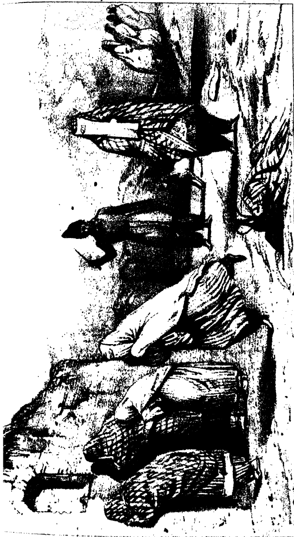
Fig. 4. Hajah, 1887, in the Quarter