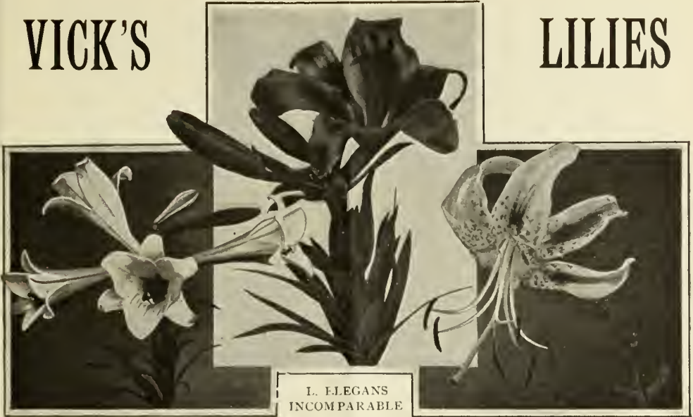
L. ELEGANS INCOMPARABLE