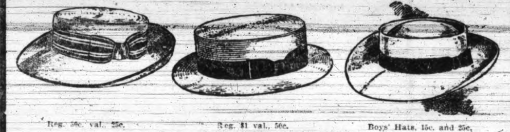
The Men's Suit values were never better at any previous sale. The sale prices are: $6.75; $11.75 and $13.75. This season's most stylish garments are being sold at $12.75.