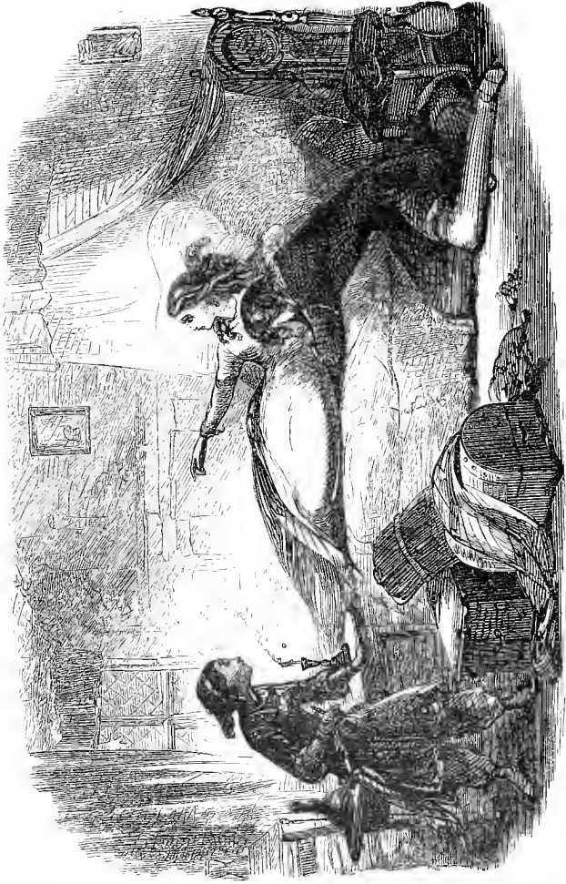
LUCILLA, GODOLPHIN, AND THE MOORISH GIRL.—p. 470.