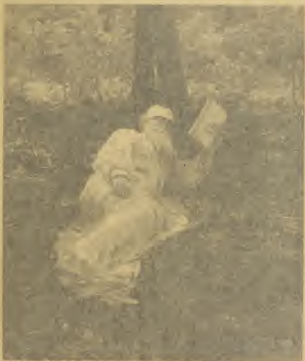
COUNT TOLSTOY AT REST