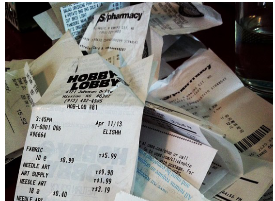
A glimpse into Sandra's everyday. 2