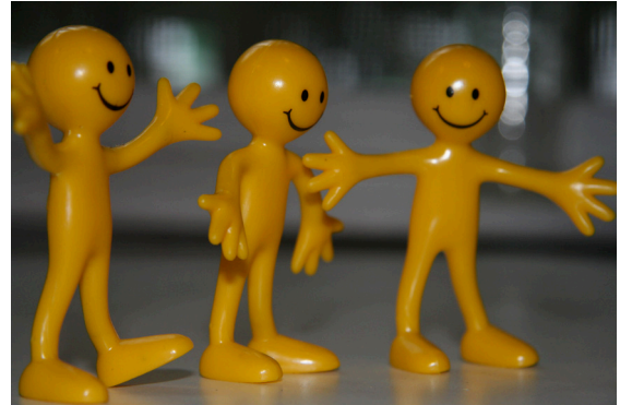
Sandra is very personable; she is always talking up a storm with her friends. 1

When she's looking for an author's bibliography, she often ends up on Wikipedia, but sometimes the bibliography is split off on a different page. This is frustrating, and she wonders why they don't have a consistent layout. Why can't the format be the same on every page?