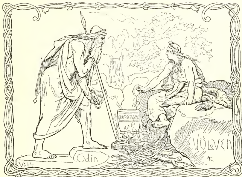
ODIN QUESTIONING VALA.

I shall bind thee with runes, that thou answer;