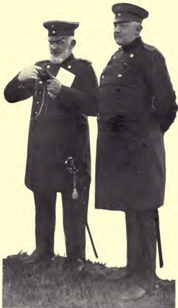
GENERALS VON HEERINGEN AND VON MOLTKE