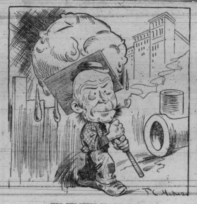
In yesterday's puzzle, by using the upper part of the picture as base, the gentleman of whom the lady is thinking is found near the bottom of the picture, his features being formed by the back of the lady.

FIFTEEN DROWNED. Faval, Awes, Oct. 13.—The American whaler Joseph Manta has wrecked on the Island of Pico, one of the Azores group, and all on board were lost. The Joseph Manta, hulled from Provincetown, Mass., and was of 1,116 tons and built in 1900 at Essex, Mass. She carried a crew of fifteen men.