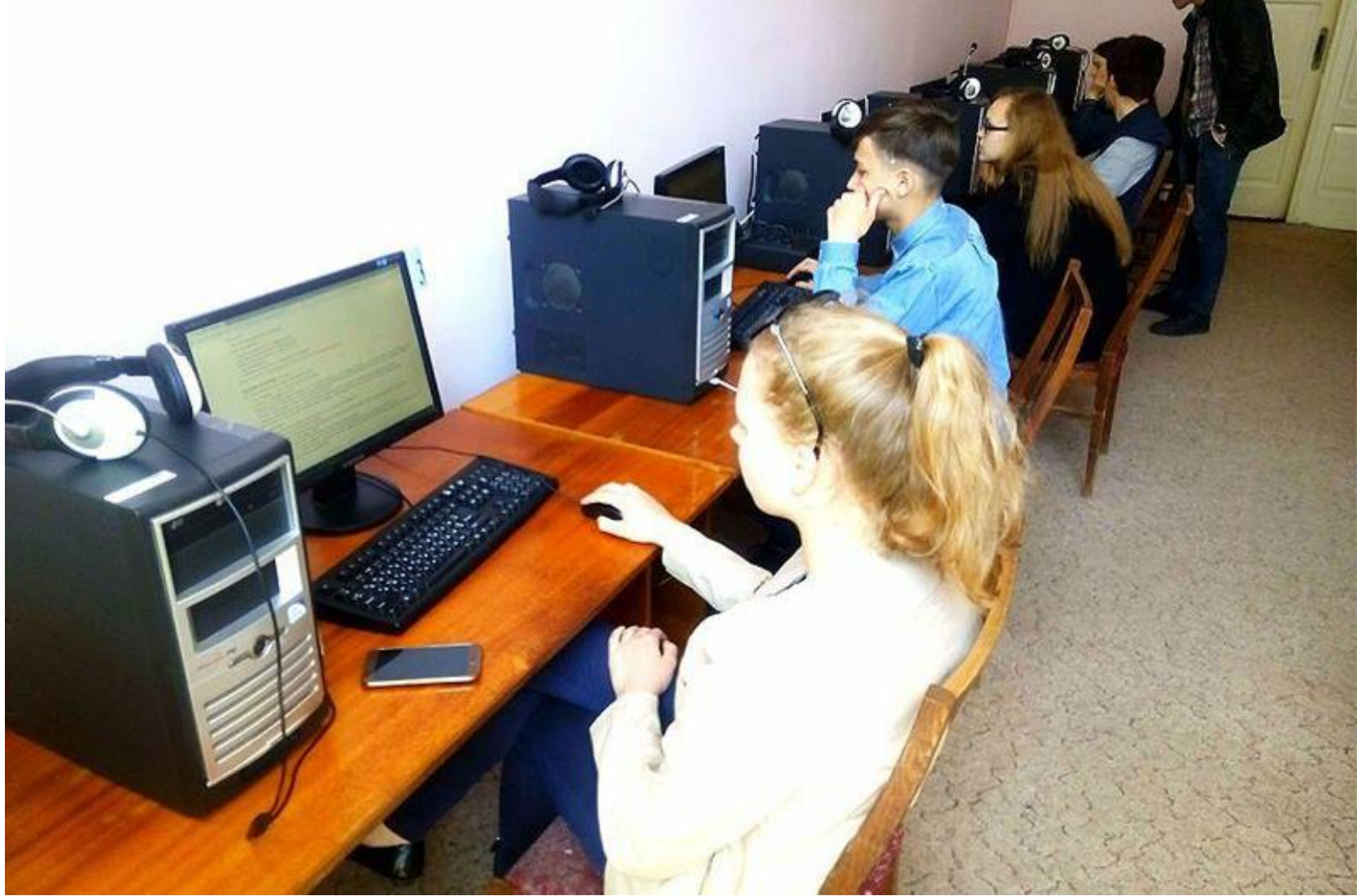
Lyceum #22 during a workshop in Korolenko library (2017)