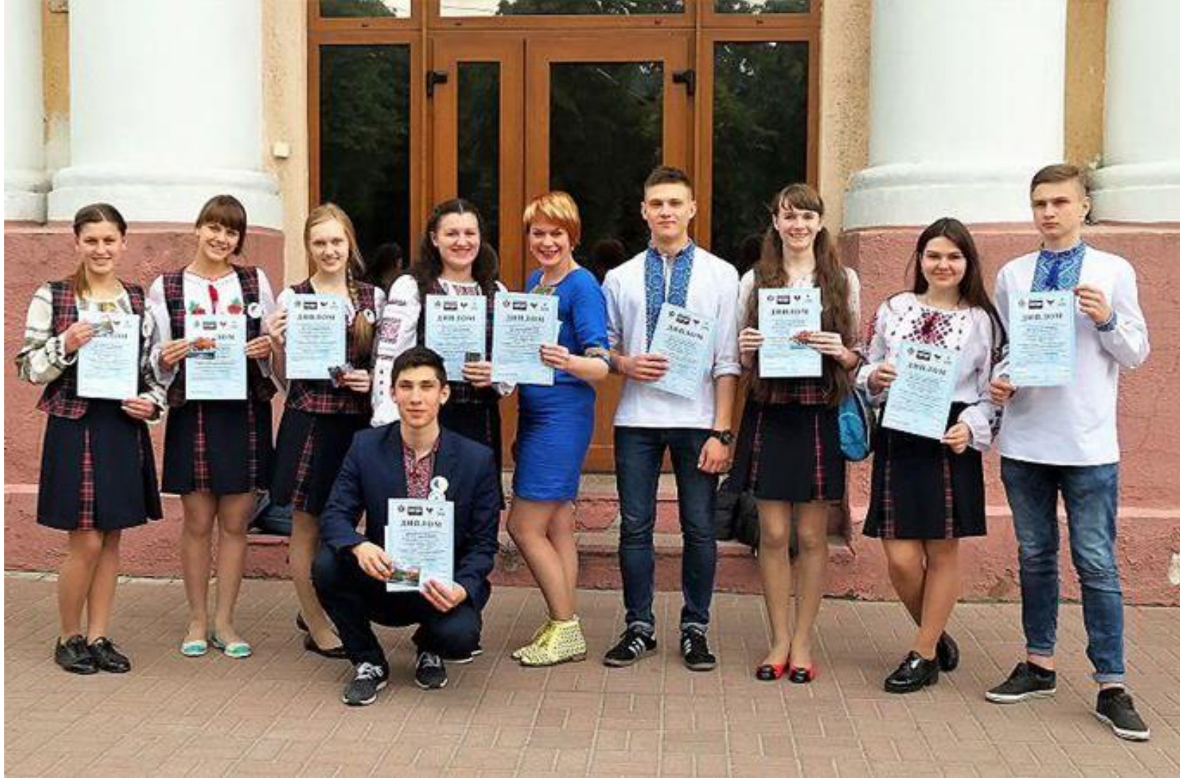
Lyceum students with diplomas (2017)