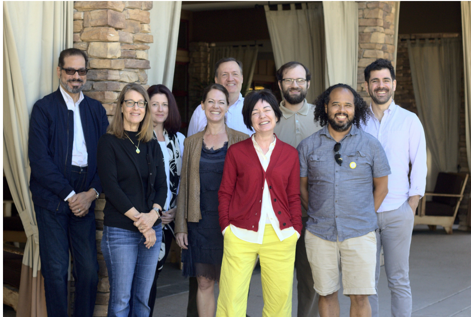
Board members at the meeting in Tiburon