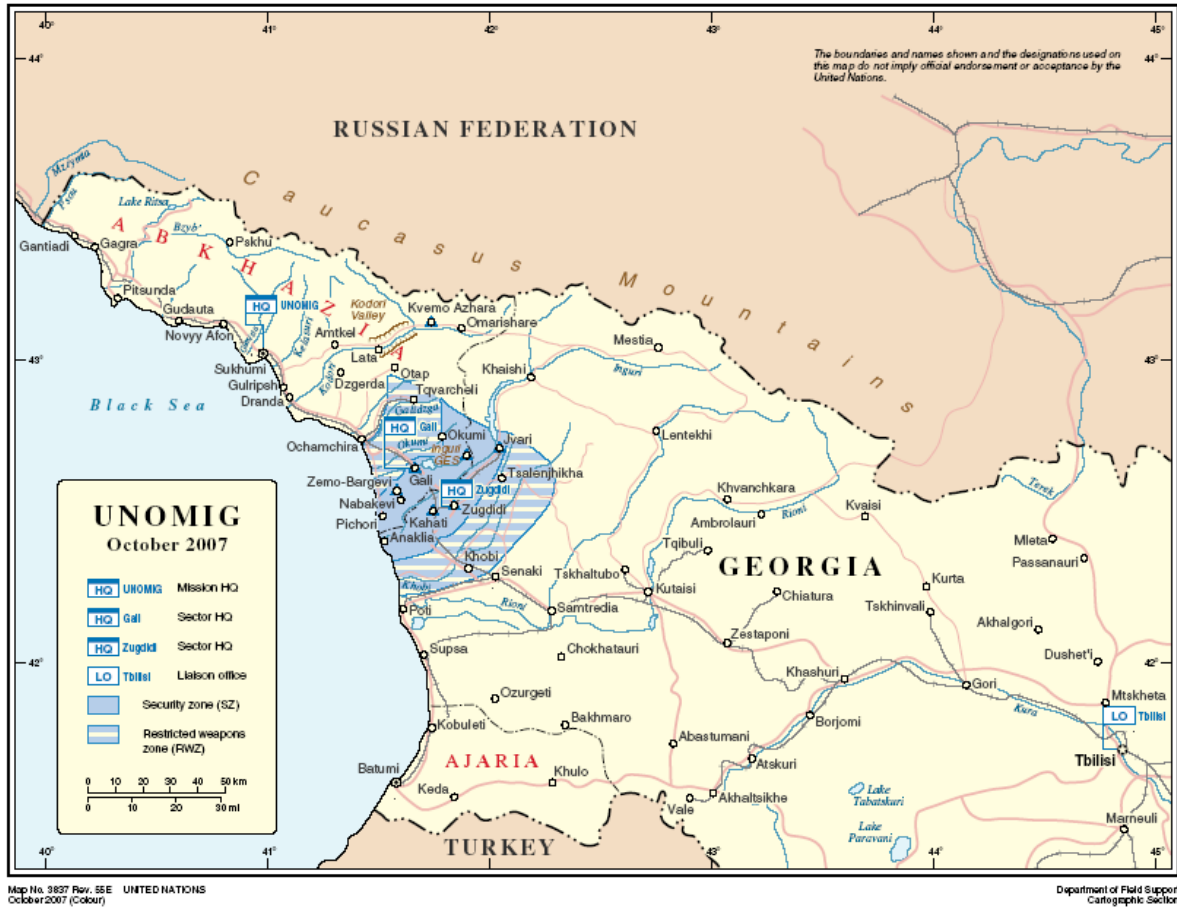
Figure 7. Security & Restricted Weapons Zones Monitored by UNOMIG (From 161)

The fact that Georgian forces demonstrated “an element of restraint from higher echelons” does not necessarily imply complicity in the incident. 162 On the contrary, initial caution seems prudent, especially given limited resources on hand and likely much uncertainty over the nature of the attack. Furthermore, the NATO allies have long been encouraging Georgia to moderate its behavior regarding the situation in the conflict zones. 163 To criticize defense officials for doing precisely what their prospective allies ask of them would be cynical at best.