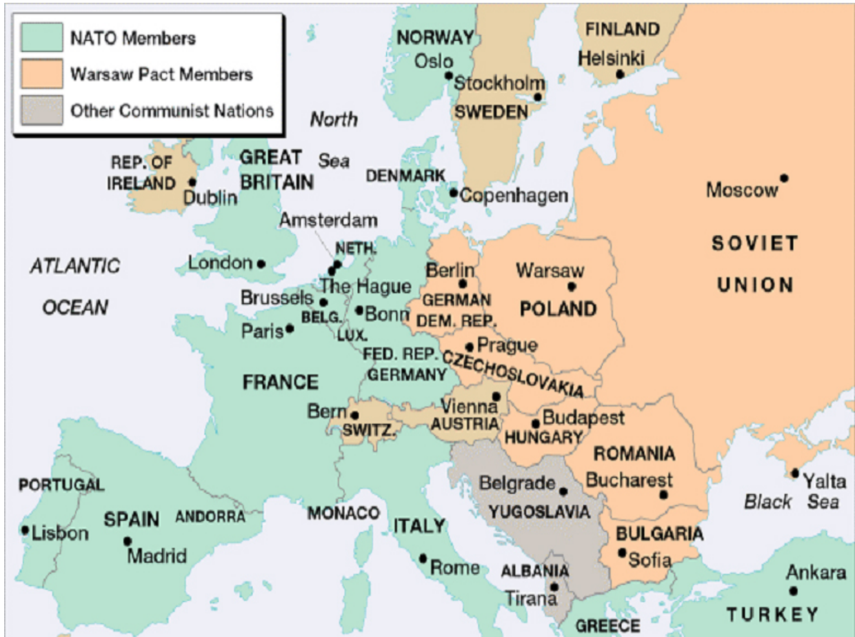
Figure 4. Post-Cold War Contraction of Russian Control (From 48 )