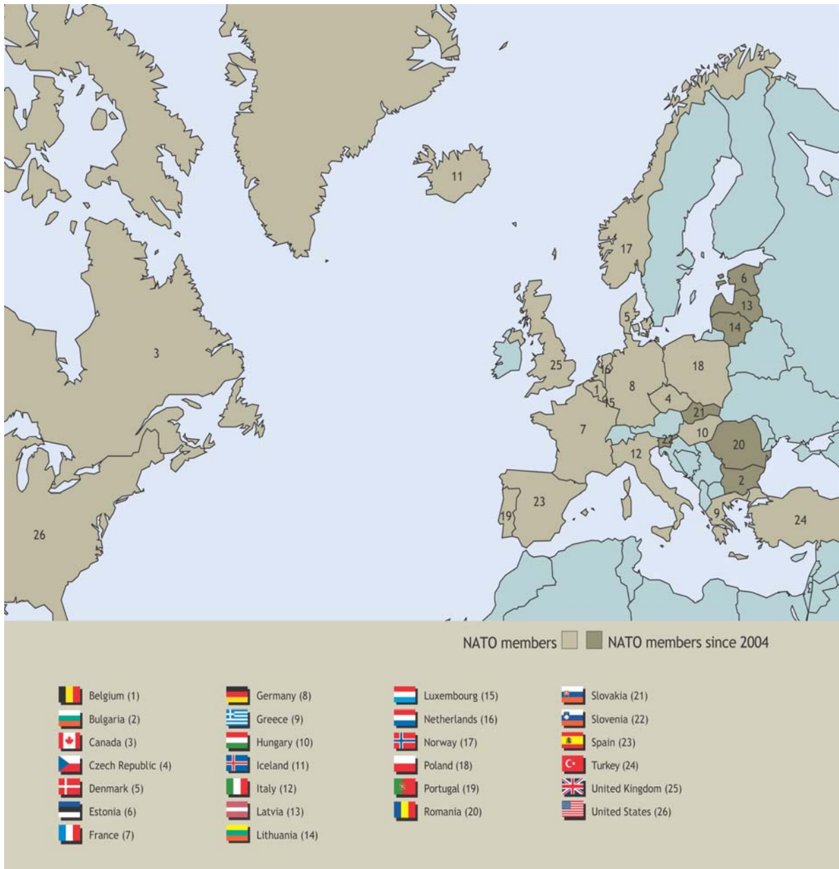
Figure 5. NATO Enlargement, 1949 to Present (From 49 )