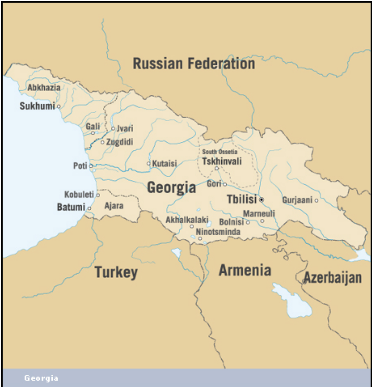
Figure 1. The Republic of Georgia with separatist regions of Abkhazia, South Ossetia, and Ajara depicted. (From 14 )