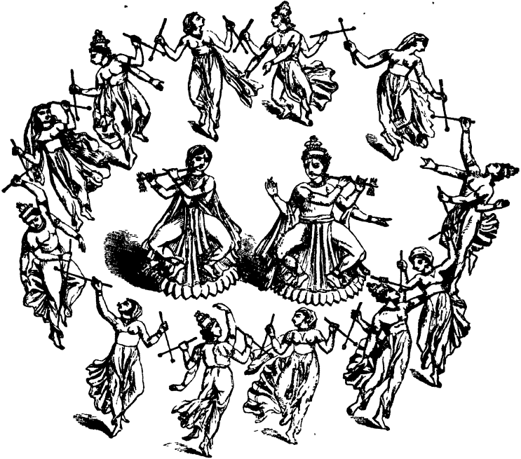
Rás Mandala, or Circular Dance.

As many cowherdesses as there were, just so many bodies did the divine Krishn Chand assume, and, taking all with him to that same terrace of the circular dance, he again commenced dancing and delight.