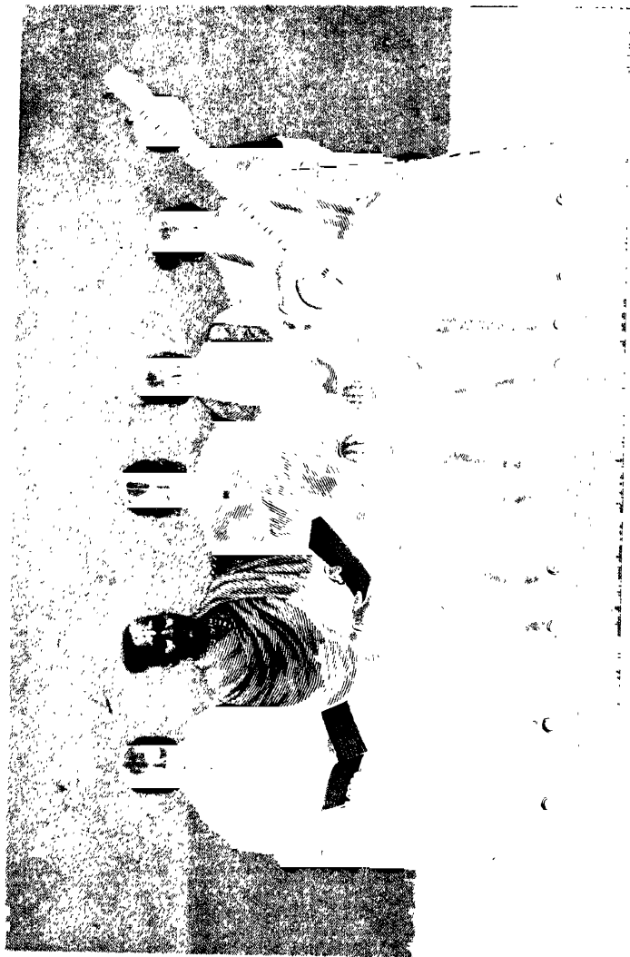
A GROUP OF THE BOMBAY MAHARAJAS.