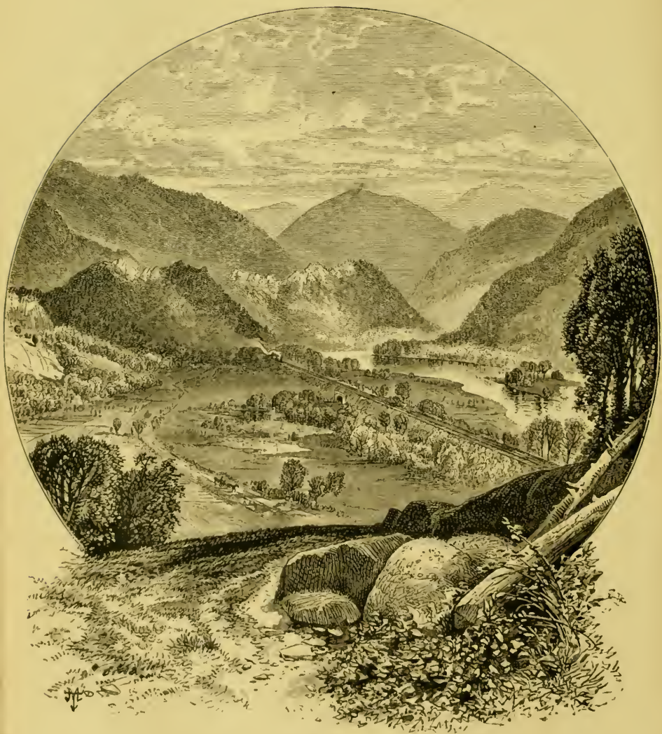
AT MILL CREEK.