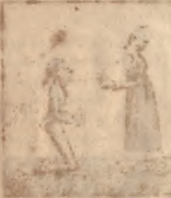
Faint, illegible text or a title located below the illustration.