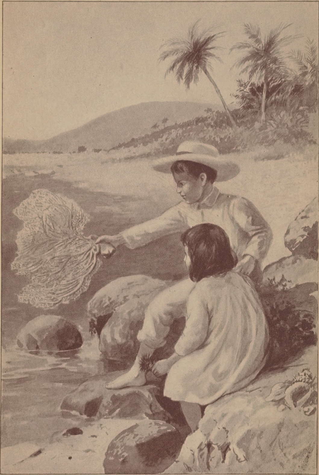
“ONE IS QUITE LARGE, AND IS FORMED IN THE SHAPE OF A FAN”