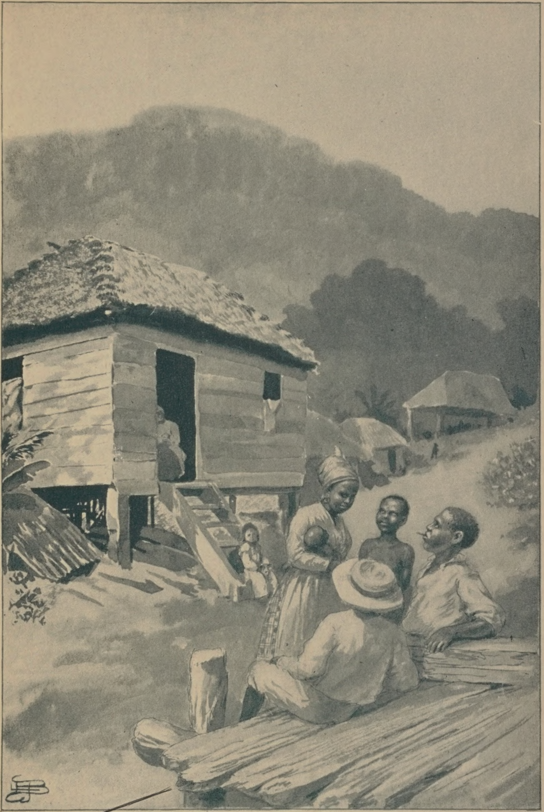
“THE HOMES OF THE WORKMEN”