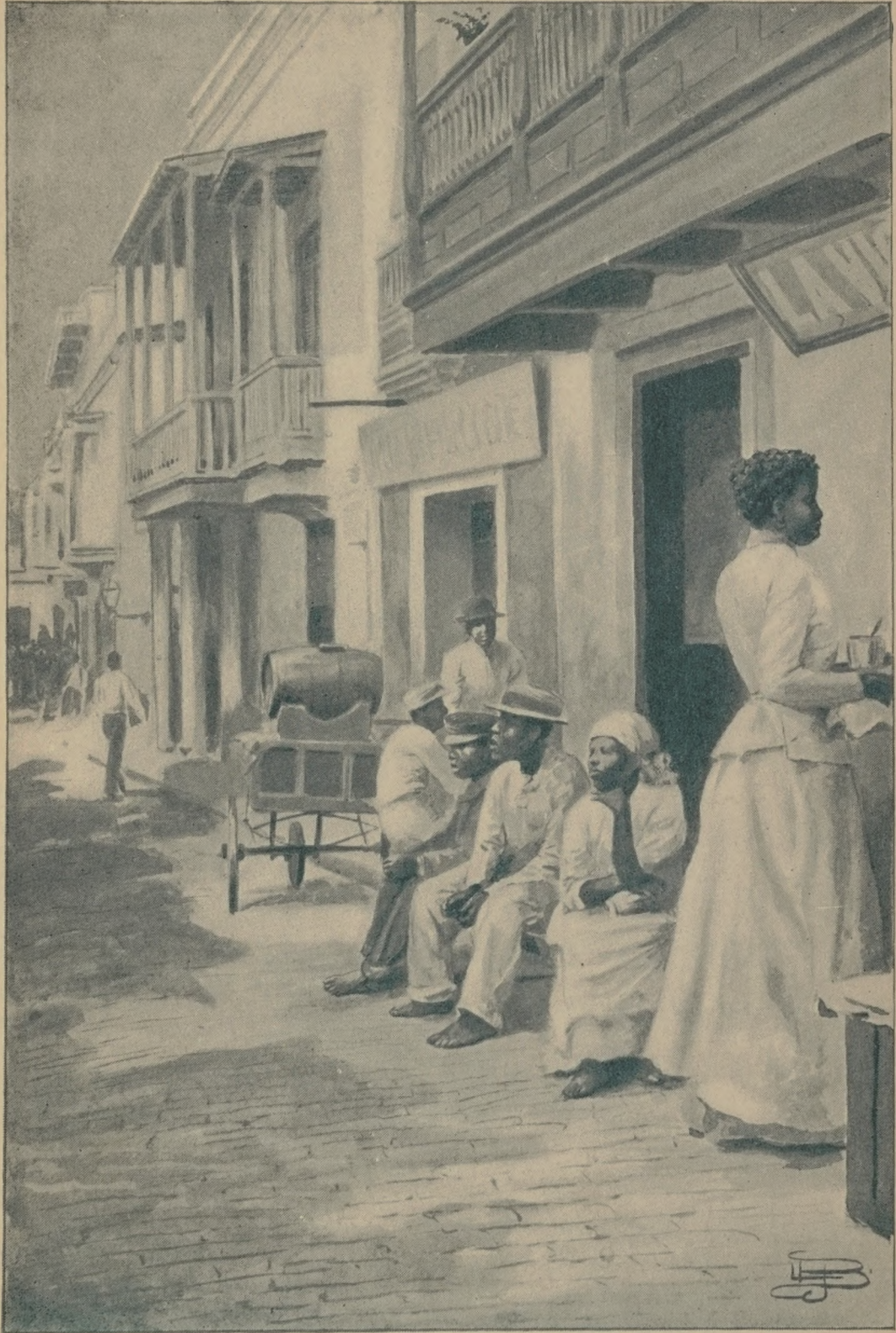
A STREET IN SAN JUAN