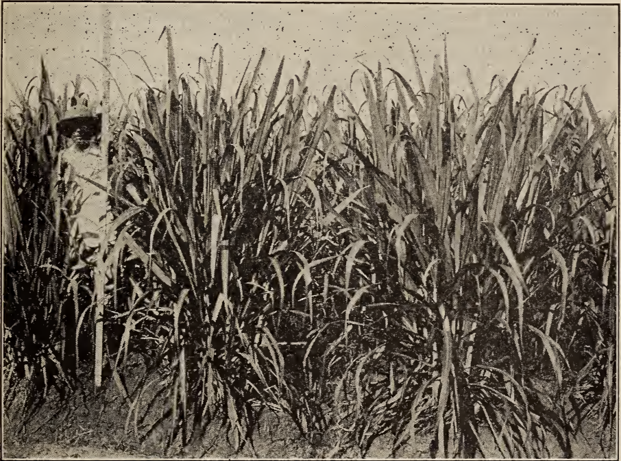
FIGURE 7.—P.O.J. 2878 is very prolific and makes rapid growth in first ratoons at Julia Farm, Central Eureka. This has resulted in low cultivation costs. Four months old when photographed, December 10, 1930.

Owing to a combination of its mosaic resistance, prolific stooling habit, and ability to withstand drought and overflow, P.O.J. 2878 is an excellent ratooner and may be grown for several stubble crops. This is generally not true for B.H. 10(12), which dies out during the second ratoon at Coloso, and cannot, owing to excessive replanting costs, be grown profitably for more than two crops. Even near