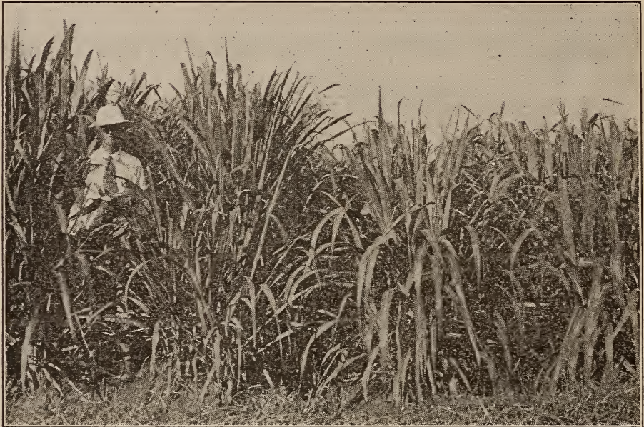
FIGURE 1.—Typical portion of half-acre plats of gran-cultura sugarcane varieties P.O.J. 2878 on the left, and P.O.J. 2725 on the right, 5 months old. P.O.J. 2878 compares well with P.O.J. 2725 in stooling habit and makes the more rapid growth throughout the crop period. P.O.J. 2878 averaged more than a foot taller than P.O.J. 2725. Photographed December 5, 1930, at Hormigueros, in the San German Valley district.

The variety trials at Cambalache, San Vicente, Central Aguirre, and Filial Amor were made by the Insular Department of Agriculture.