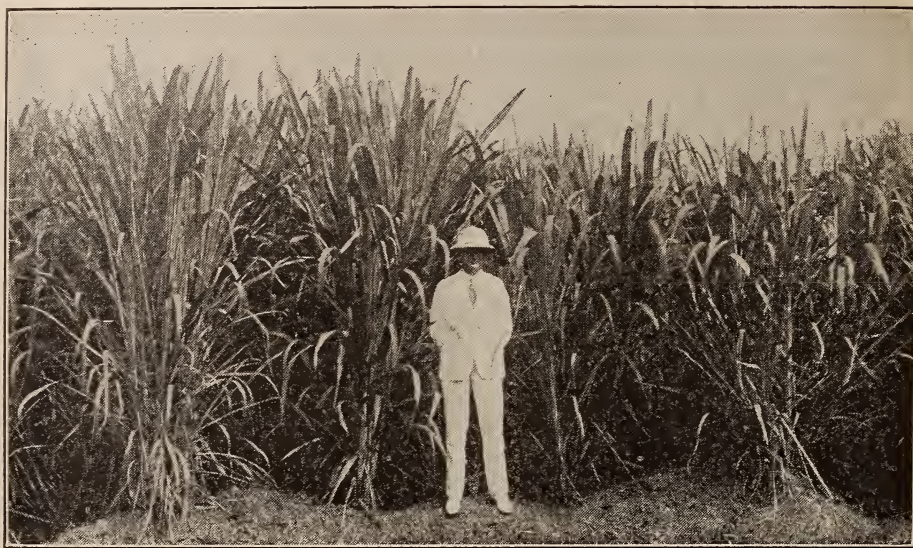
FIGURE 5.—P.O.J. 2878 makes a rapid early growth in the Anasco Valley gran-cultura plantings. P.O.J. 2878, on the left, is taller than B.H. 10(12), on the right, 7 months old, at Hacienda Esperanza, Central Pagan. Photographed December 20, 1930.

The general field results with approximately 50 acres of P.O.J. 2878 gran cultura at Central Pagan in the 1931 crop were not considered