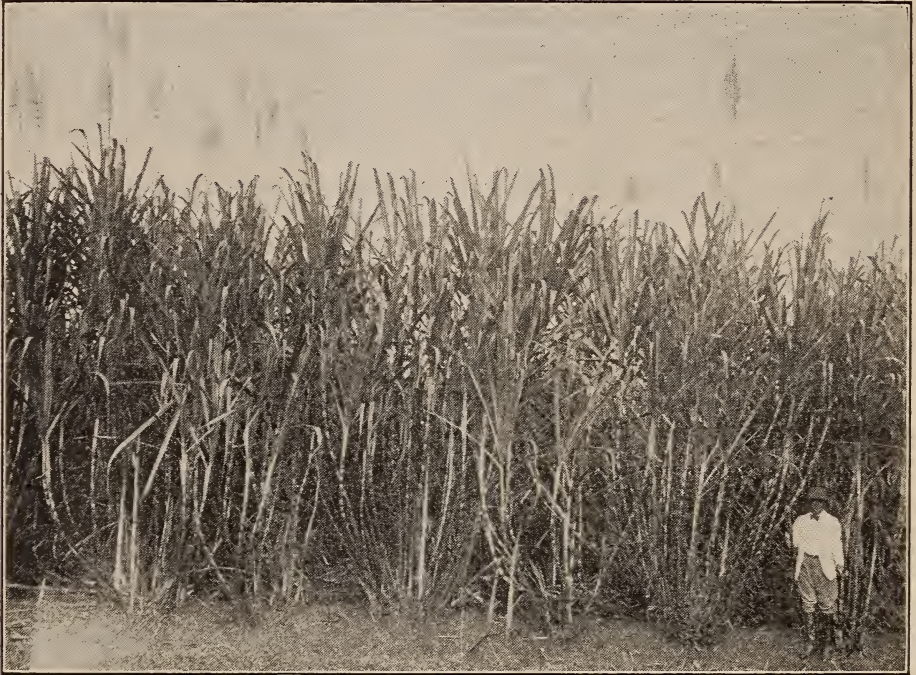
FIGURE 4.—P.O.J. 2878 made splendid growth in a long first-ratoon crop at Coloso. Photographed December 19, 1930.

Varietal adaptability at Isabela. —At Isabela the subsoil is so porous that water filters rapidly from the surface. This fact and the drying effect of an almost continuous wind render irrigation water inadequate during periods of low rainfall. S.C. 12/4 and other susceptible varieties become heavily infected with mosaic and must be rogued out, thus increasing planting costs. Hence, drought and mosaic are