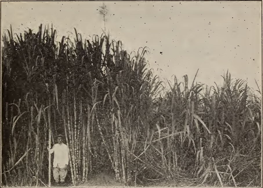
FIGURE 6.—Gran-cultura sugarcane varieties P.O.J. 2878 on the left and B.H. 10(12) on the right, 15 months old, at Central Eureka, in the San German Valley. Photographed December 10, 1930.

P.O.J. 2725, as these data show, also gave good tonnage in this district in 1931, but the purity was low. On several occasions cars of the cane had to be unloaded and the canes sorted out, the rotten or immature canes being discarded, to secure satisfactory sugar yields.