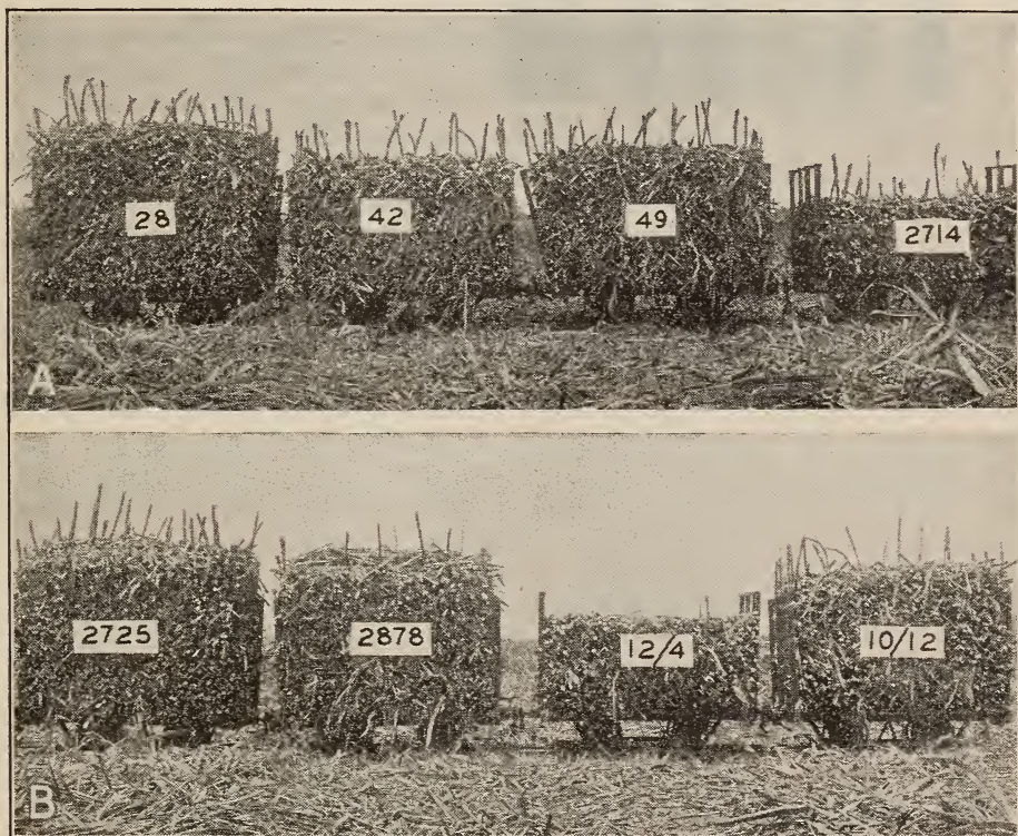
FIGURE 2.—P.O.J. 2878 compared well with Mayaguez 28, P.O.J. 2725, and B. H. 10(12) in cane production at Coloso. The carts were arranged in the same order as were the plats. Each car carried the cane of a \frac{1}{2} -acre plat. Mayaguez 28, P.O.J. 2878, and B.H. 10(12) showed little difference in either cane production or sucrose content.

S.C. 12/4 was decidedly inferior in production to P.O.J. 2878. Considering the advantage of the latter, due to mosaic resistance and