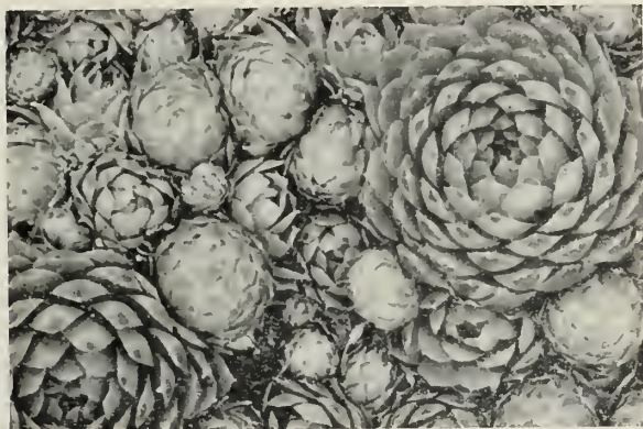
GLOBE HENS AND CHICKENS