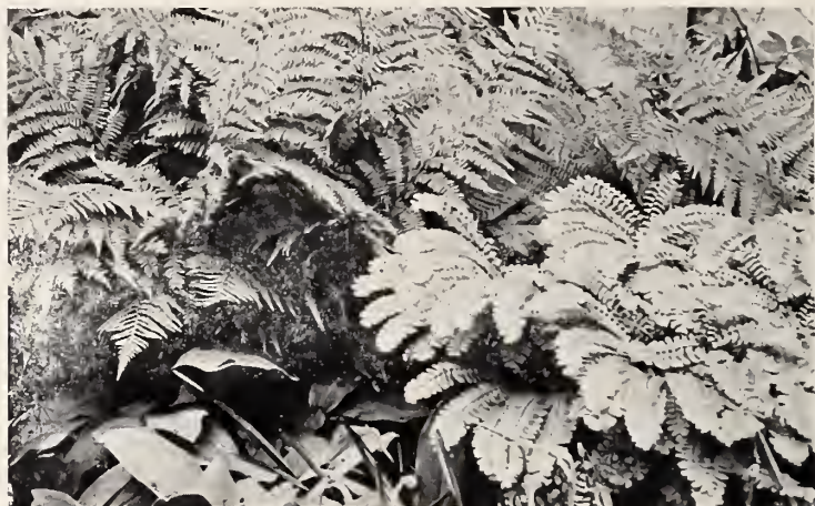
FERNS IN A SHADY CORNER

We urge the more generous planting of ferns. In shady places where nothing else will grow, for foundation plantings where snow breaks down shrubs and evergreens or for any informal little nook they add a touch of fresh cool northern woods. For naturalizing in large areas, we can furnish them in lots of 500 to 1,000 each, and on quantities of this sort we shall be glad to make special prices.