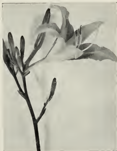
TAWNY DAY LILY

FICKLE SUNROSE, H. mutabile . Bright green mounds of evergreen leaves covered throughout the Summer with miniature flowers. Like single roses in white, red, pink or yellow. Sun loving and drought resistant. Excellent rock garden plant.