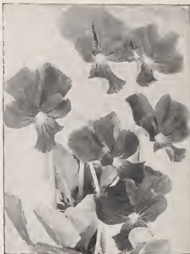
VIOLA, JERSEY GEM

ARKWRIGHT RUBY. Free Flowering Ruby Crimson. Somewhat larger than ordinary violas.