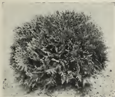
GLOBE ARBOR VITAE

GLOBE ARBORVITAE. T. occidentalis woodwardii. Small, roundheaded type, very popular for tubs and formal planting. 12 to 15 in. $2.00 each; 15 to 18 in. $2.50 each.