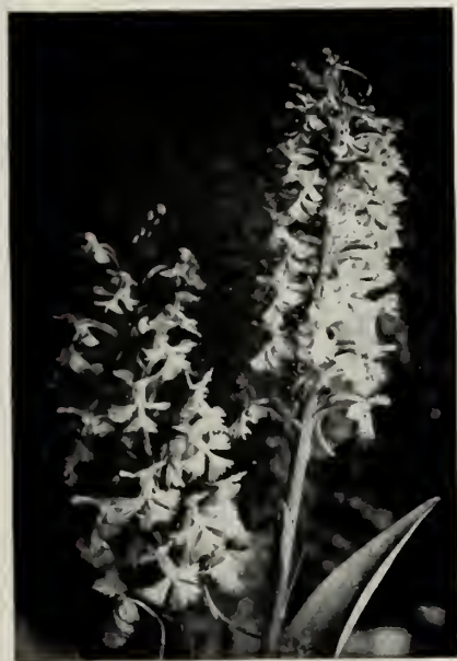
PURPLE FRINGE ORCHID

LARGE PURPLE FRINGE-ORCHID, Habenaria fimbriata . Fragrant lavender spikes in late July and August. Prefers a damp spot among marsh ferns and grasses. 75¢ each, 3 for $2.00, $7.50 per dozen.