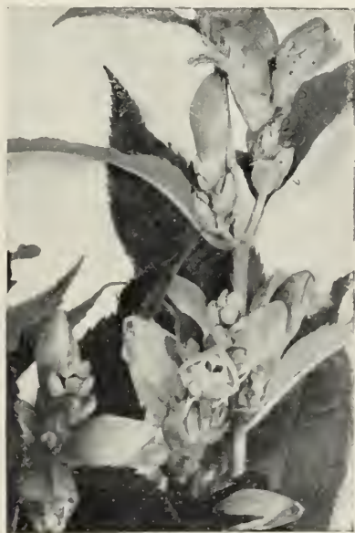
PINK TURTLE HEAD

PINK TURTLEHEAD , C. lyoni . Satiny pink hood-shaped flowers in August and September. Thrives well in moist or half-shady spots or will grow in full sunlight. Excellent for the Fall border.