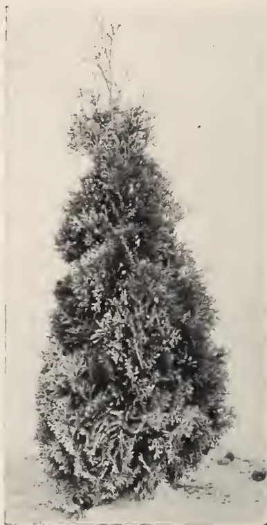
PYRAMIDAL ARBOR VITAE

NORWAY SPRUCE. P. excelsa . The most rapid growing Spruce with wide, spreading pendulous branches. The cones are very ornamental, growing 5 to 8 inches long. Useful for wind-breaks, landscaping or even low-growing hedges. 18 to 24 in. $2.00 each. 2 to 3 ft. $2.75.