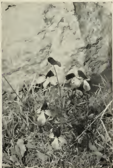
BI-COLORED BIRDSFOOT VIOLET

BIRDSFOOT VIOLET, Viola pedata . Deep blue flowers on stems nearly a foot high. Finely cut foliage. Dry, sandy soil in sun or light shade.