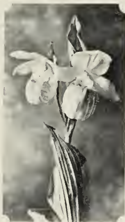
SHOWY LADY SLIPPER

WILD GINGER, Asarum canadense. Heart-shaped, fuzzy, gray-green leaves. Tiny, deep maroon, three petal flowers resting on the ground in late April and May. Rich woods soil. Partial shade. 3 to 4 in.