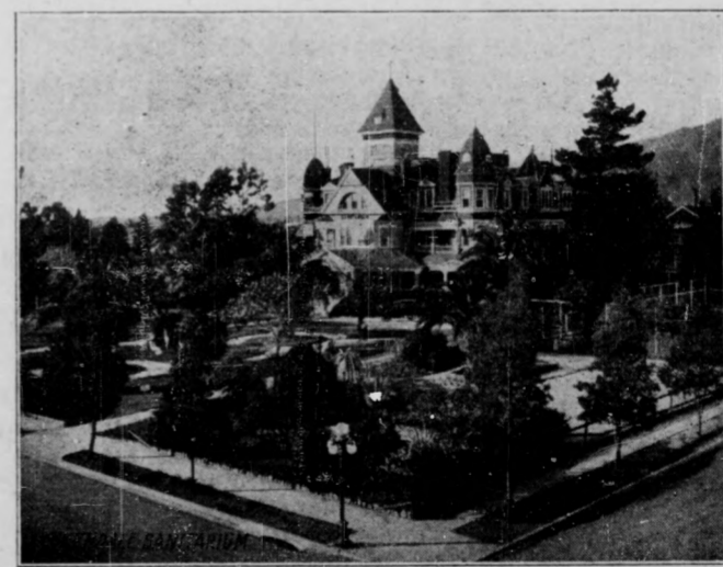
"The Pacific Portal to Health"

Battle Creek Methods. Modern Therapeutic Equipment. Hospital Separate from Main Building. Graduate Nurses, both Ladies and Gentlemen