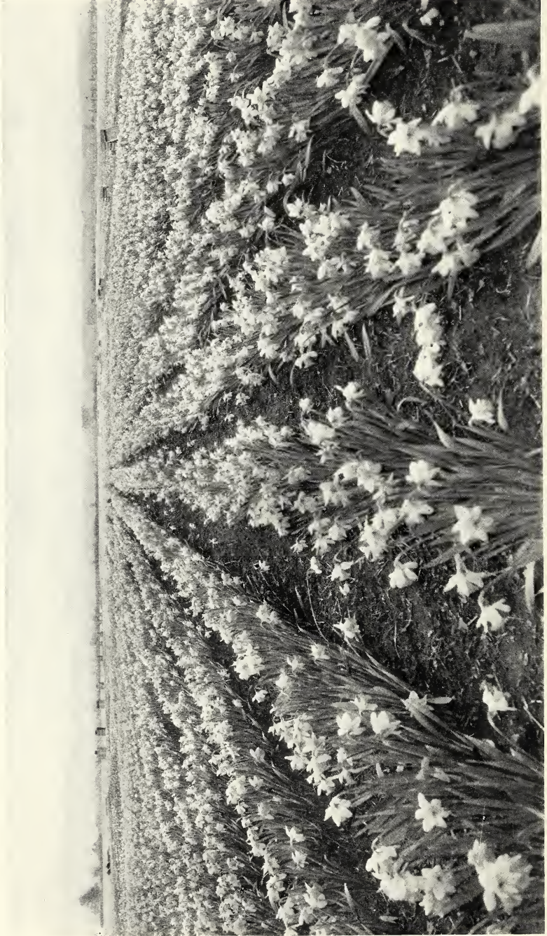
A Field of Narcissus, Spring Glory, at our Woodland Wash. Bulb Farm