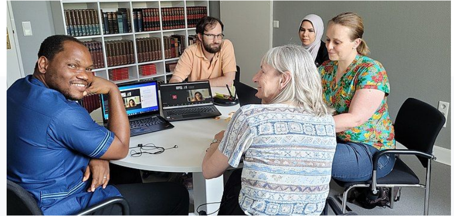
Abbad Diraneyya - CC BY-4.0

Values and Principles Preamble Roles & Responsibilities