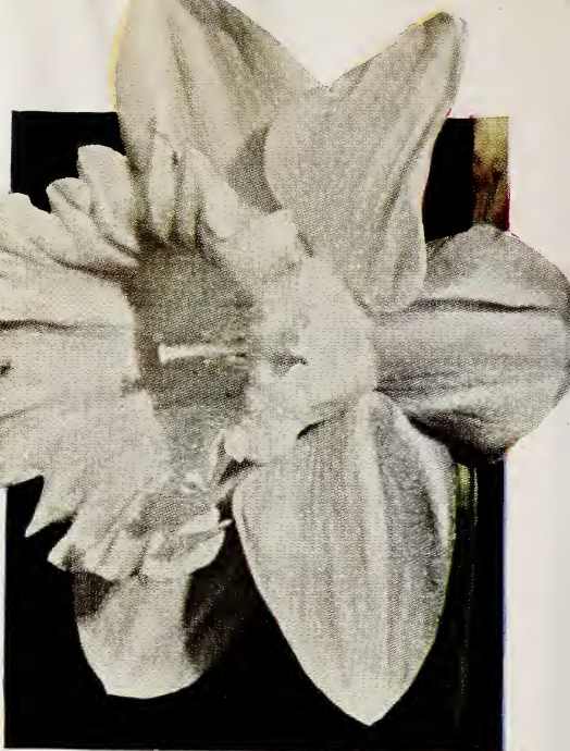
Narcissus, Mount Hood (See page 8)