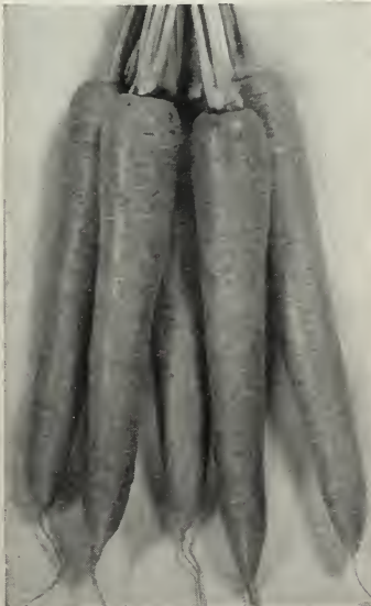
181—Carrots, Gold Pak