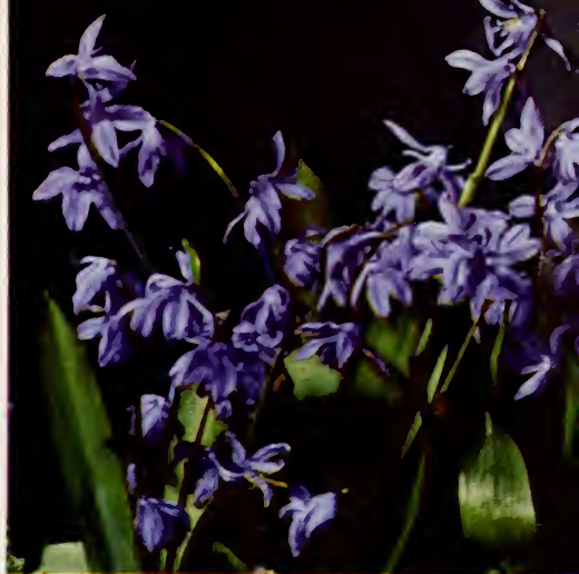
Scilla Sibirica—Excellent Border (See page 6)

BULB PLANTERS Make Bulb Planting Easier See page 2