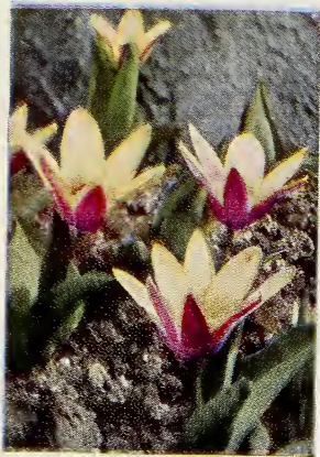
Kaufmanniana (See page 4)