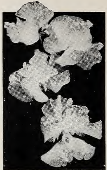
Cuthbertson Sweet Peas