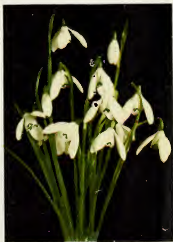
Snowdrops (See page 6)