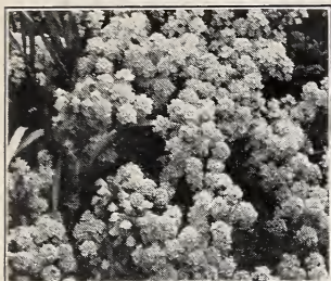
Alyssum Saxatile Compactum