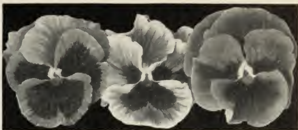
Pansies, Swiss Giants