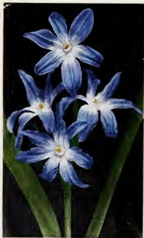
Chionodoxa (See page 6)