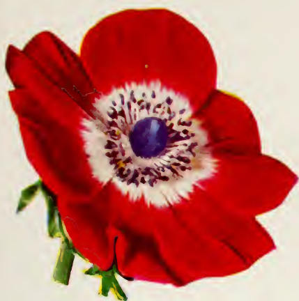
St. Brigid Anemone (See page 6)