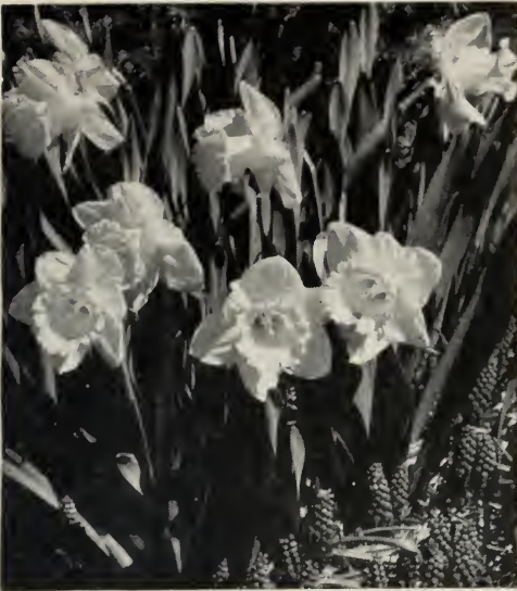
Narcissus and Grape Hyacinths (For Grape Hyacinths see page 6)