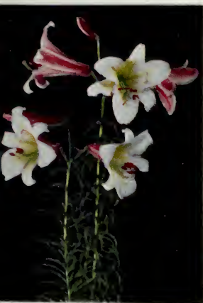
Regal Lily—Hardy. 4 to 6 ft. (See page 6)