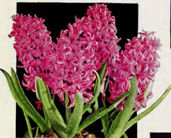
Hyacinth, Queen of Pinks (See page 5)

Wyatt-Zuarles OFFERS FINEST HOLLAND GROWN BULBS