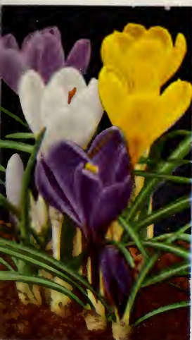
Crocus for Lawn and Garden (See page 6)

BULB PLANTERS Make Bulb Planting Easier See page 2