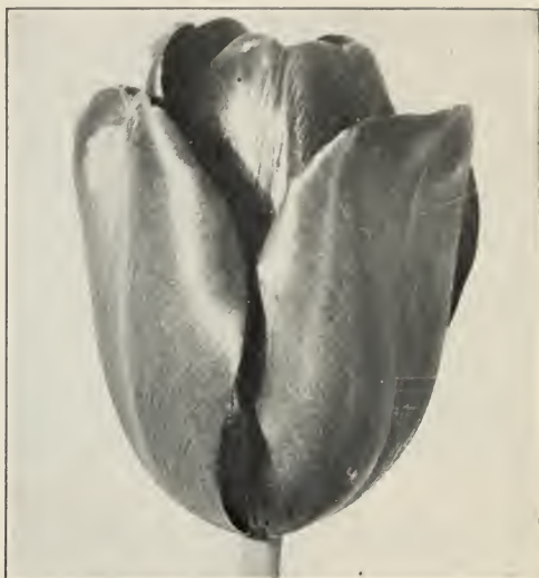
Queen of the Night

MME. BUTTERFLY. (D). A lovely bluish violet, paler edged; intense black anthers set in a pure white base.