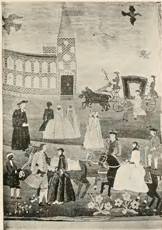
WEDDING PARTY IN BOSTON IN 1756