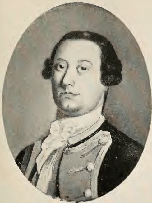
GENERAL JOSHUA WINSLOW