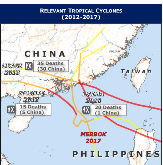
Copyright, European Union, 2017. Map created by EC-JRC/DG ECHO. The boundaries and names shown on this map do not imply official endorsement or acceptance by the European Union.

Sources: GDACS, JTWC, CMA, HKO, Local media