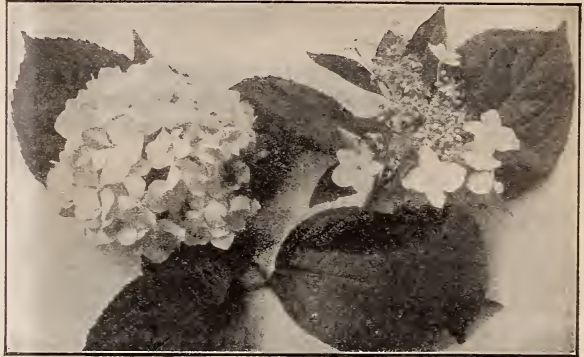
Hydrangeas, Thomas Hogg and Japonica, at Fruitland

Otaksa . An improved variety of Hortensis ; flower heads very large; pale rose or blue, according to soil.