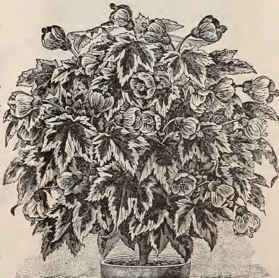
Abutilon, Souvenir de Bonn

A most ornamental plant of the Caladium family, with immense, light-green, stiff leaves. 25 cts. to $1.