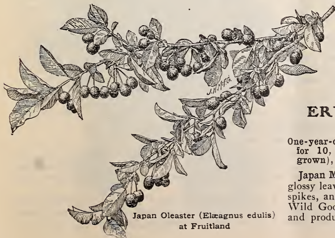
Japan Oleaster ( Elaeagnus edulis ) at Fruitland

Japan Medlar. Trees of medium height, with long, glossy leaves, which are evergreen; flowers white, in spikes, and produced in winter; fruit of the size of a Wild Goose plum, round or oblong, bright yellow, and produced in clusters; subacid and refreshing.