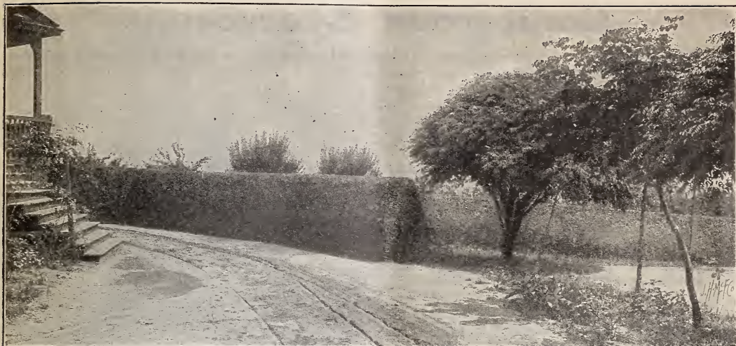
Amoor River Privet Hedge