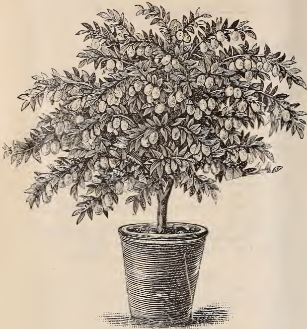
Kinkan, or Kum Kwat Oranges