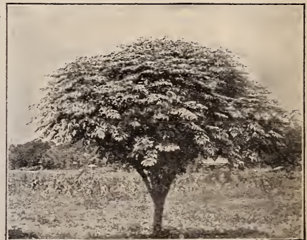
Texas Umbrella Tree at Fruitland (see opposite page)

Annularis, or Ring-Leaved. Of rapid growth, erect, and with leaves singularly curled like a ring. Very odd. 25 cts. each, $2 for 10.