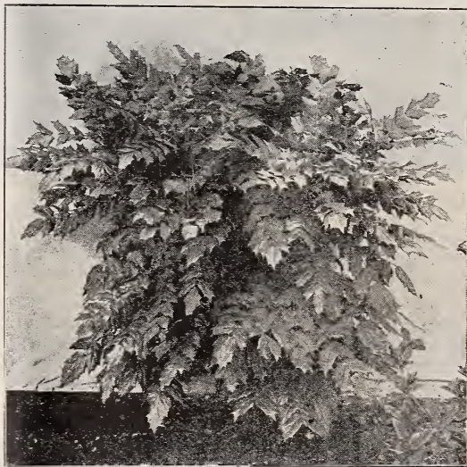
Berberis Japonica at Fruitland

These are valuable shrubs; their principal merits are great vigor, beautiful, broad, shiny foliage, and