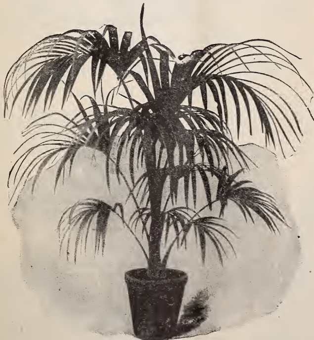
Kentia Belmoreana (See page 46)

Those unfamiliar with Palms will do well to allow us to select for them, as our experience enables us to send out plants which will be most hardy and effective, and show the greatest distinction in any location.