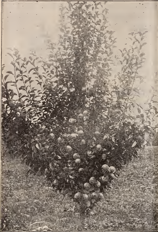
Four-year-old Kieffer Pear Tree at Fruitland.

from Sept. to Oct. Tree very vigorous and very prolific. Begins to bear when four years old. As a fall Pear, there is no variety as yet disseminated which has given such profitable returns, and the wonderful fertility of the trees is surprising. Many of our trees, four years after planting, have yielded as high as three bushels of perfect fruit. If allowed to hang upon the tree until the beginning of October, and then carefully ripened in a cool, dark room, there are few Pears which are more attractive. In point of quality it combines extreme juiciness with a sprightly subacid flavor and the peculiar aroma of the Bartlett; it is then an excellent dessert fruit.