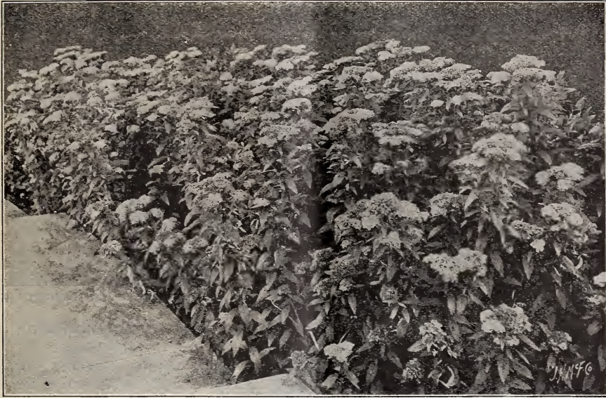
Spiraea Anthony Waterer at Fruitland