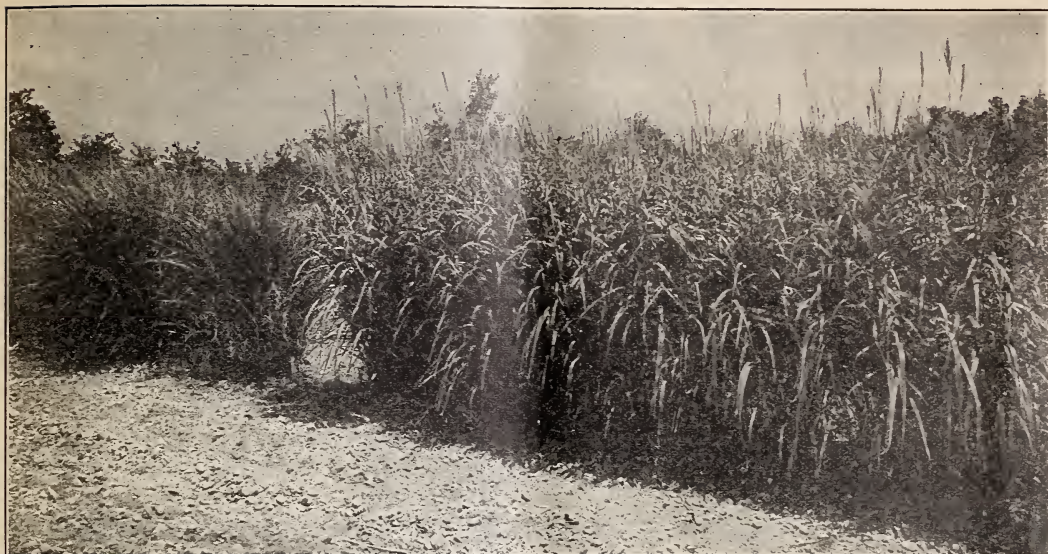
Eulalia Japonica zebrina and Univittata at Fruitland