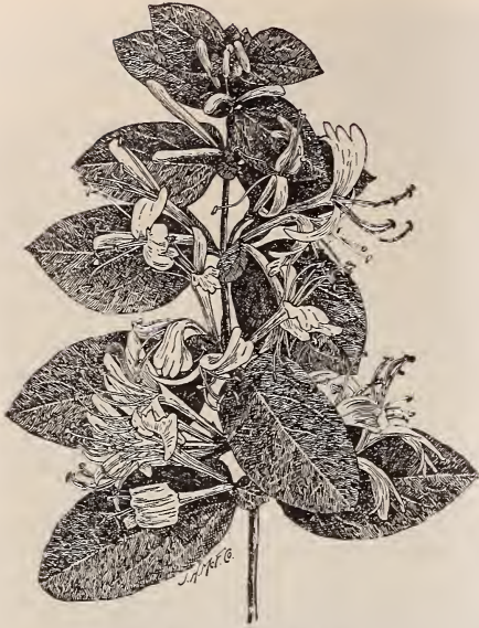
Spray of Honeysuckle