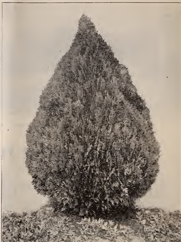
Biota aurea nana at Fruitland

Biota aurea conspicua . Another new variety of