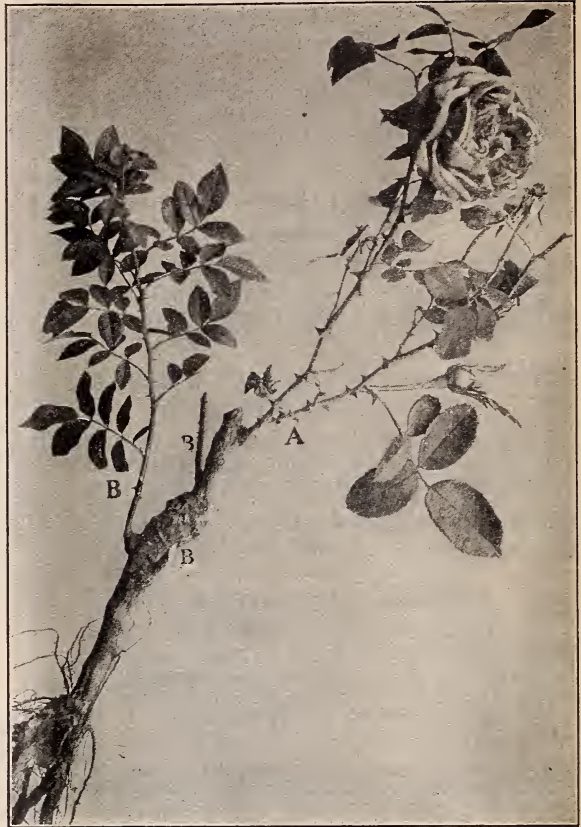
Rose Budded upon Manetti

Sunset. A sport of Perle des Jardins, of a rich, tawny yellow.