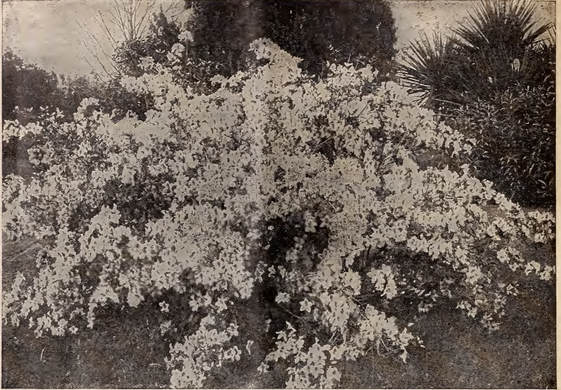
Azalea Indica at Fruitland