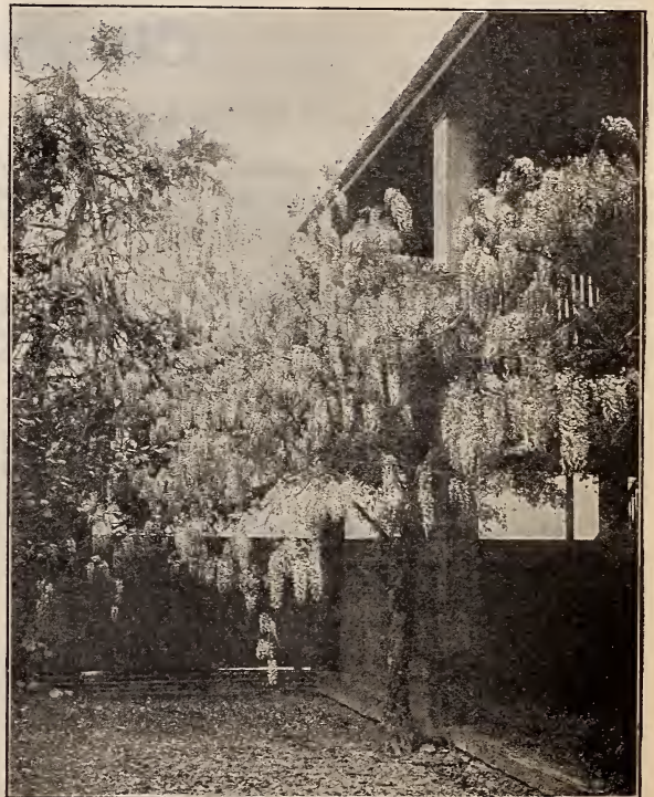
Wistaria Sinensis at Fruitland

Frutescens magnifica. Flowers in long tassels, pale blue; blooming later than the Chinese varieties, and also producing flowers during the summer; extremely vigorous.