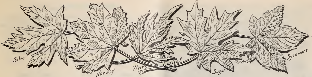
Specimens of Maple Leaves