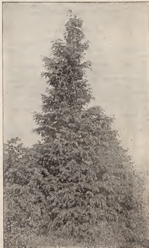
Cupressus Lawsoniana at Fruitland

Sempervirens pyramidalis (Oriental, or Pyramidal Cypress). Of compact and shaft-like habit. 25 to 50 cts.; large specimens, $1 and $2.