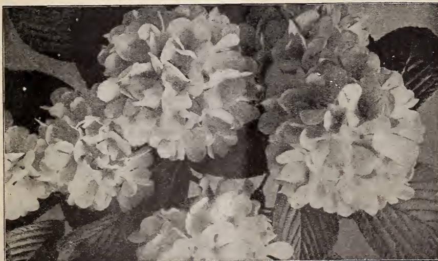
Viburnum at Fruitland

A beautiful ornamental foliage and flowering plant. Its sword-like foliage and tall, branched spikes of large, fragrant, creamy white flowers make it an effective plant for the lawn. Desirable for urns and jardinieres in exposed positions. 25 and 50 cents.