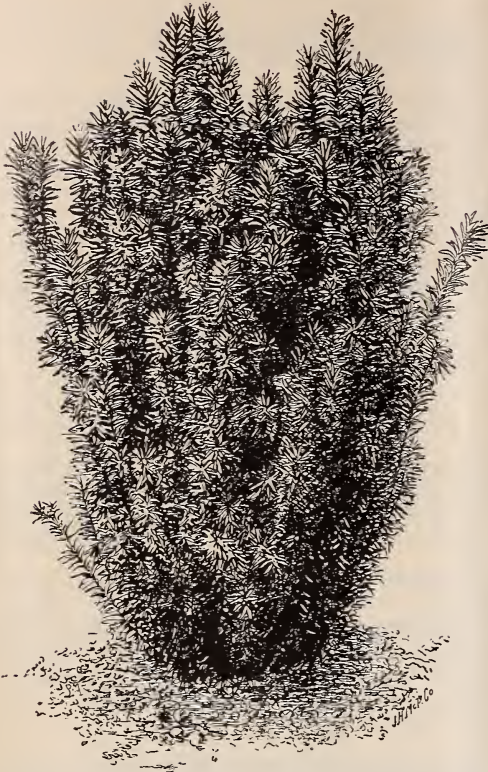
Podocarpus Korænsis at Fruitland