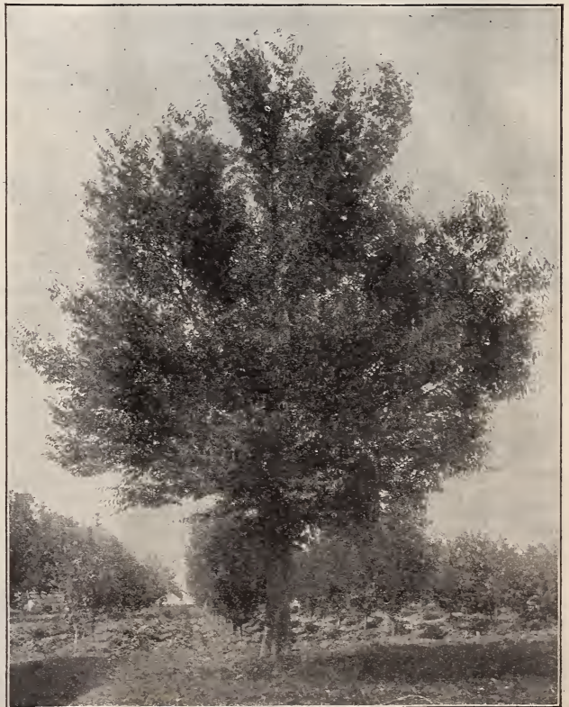
Celtis Davidiana at Fruitland

ing branches; foliage deep green and very smooth bark. A very rare and desirable shade tree which, after 15 years' trial in our grounds, has been entirely free from insect depredations. The picture shows its beautiful shape and character. Plants from 4-inch pots, 3 feet high, 25 cts.; 5 to 6 feet, 50 cts.