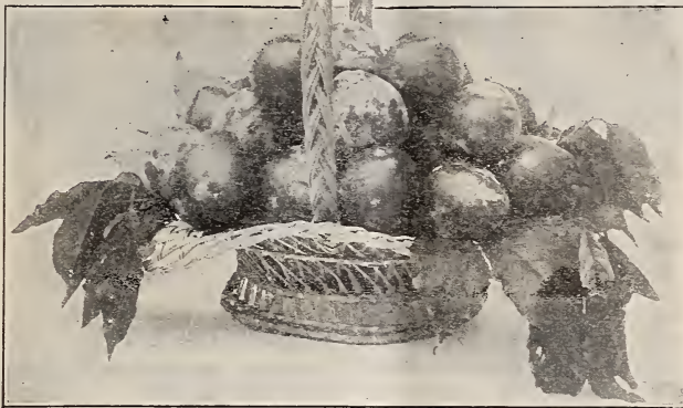
Red Nagate and Abundance Plums at Fruitland

Red Nagate, Red June, or Long Fruit . Pointed; 1\frac{3}{4} by 1\frac{1}{2} inches; skin thick, purplish red, with blue bloom. Flesh yellow, solid, somewhat coarse-grained, juicy, subacid, with Damson flavor; clingstone; quality good. Very prolific, showy and attractive in color. It ripens a week before Abundance, and is the earliest large-fruited market variety. Keeps well. Splendid shipper.