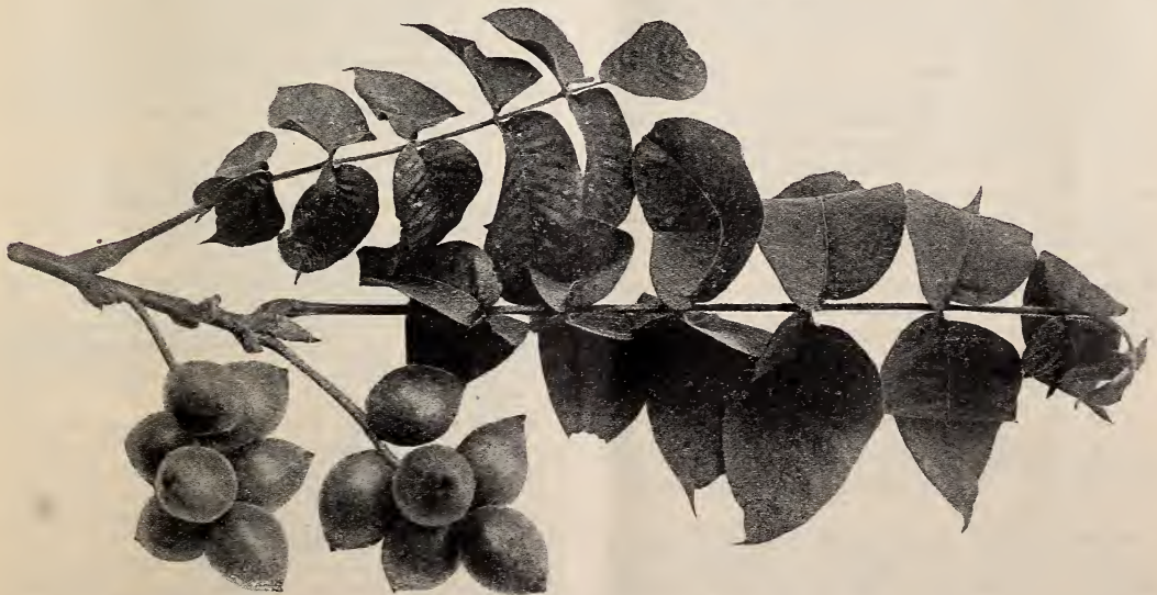
Japan Walnut ( Juglans Sieboldii ) at Fruitland