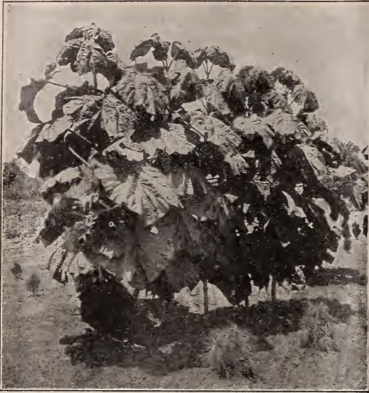
Paulownia imperialis at Fruitland