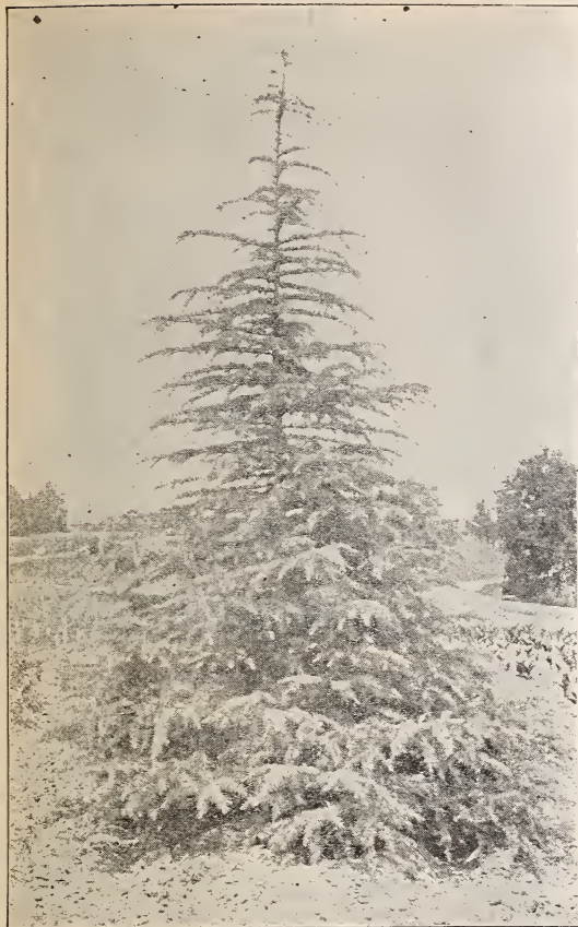
Cedrus deodara at Fruitland