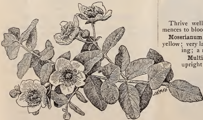
Hypericum Moserianum at Fruitland

This plant has created a sensation in Europe, where it was offered in 1892 for the first time. It is a Scotch Broom with red and yellow flowers, and has already become very popular for forcing, although the plant is hardy here. Flowers on long bunches; ground color of corolla is golden yellow; lower and lateral petals with a crimson border. This plant is in full bloom during April, and is most attractive. Strong plants, 25 cts. each.