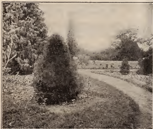
Biota Japonica filiformis at Fruitland

Thuja globosa . Of spherical and compact growth. Ultimate height, 4 to 6 feet. 25 to 50 cts.