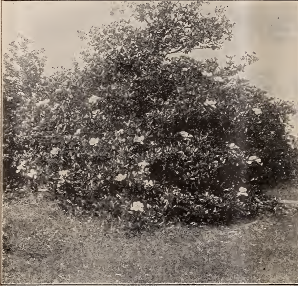
Magnolia grandiflora at Fruitland

A shrub of medium height; foliage very glossy; flowers creamy white, produced in great profusion during June, and delightfully fragrant, rivaling in this the popular Tea Olive. The flowers are followed by red berries, which are retained all winter. 25 and 50 cts.