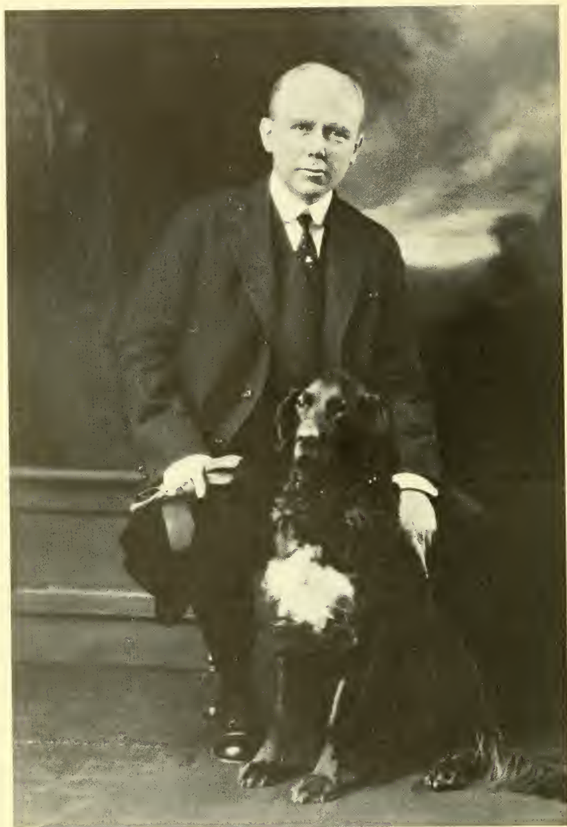
GOVERNOR PERCIVAL P. BAXTER AND HIS IRISH SETTER "GARRY"