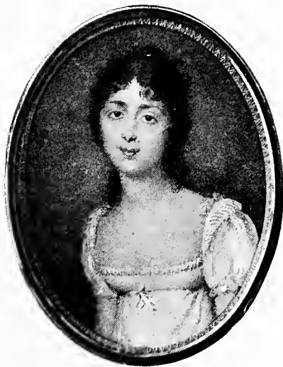
DÉSIRÉE, QUEEN OF SWEDEN.