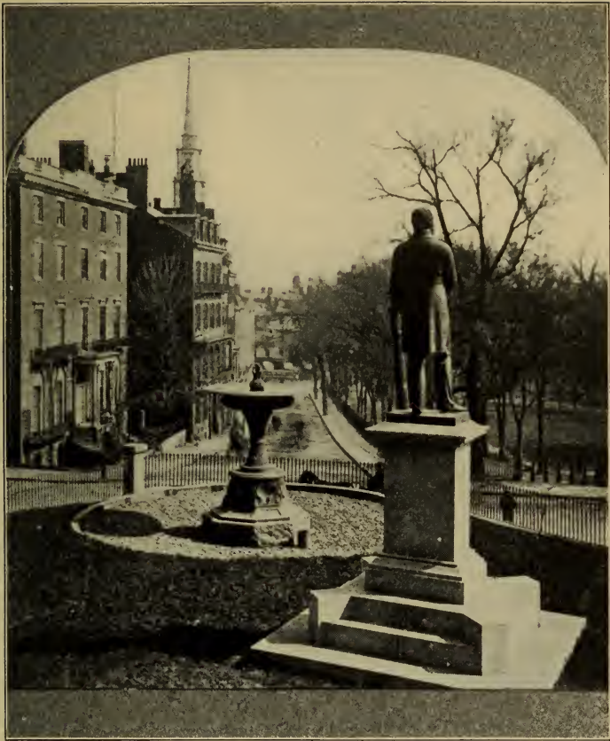
VIEW OF PARK STREET FROM THE STATE HOUSE Showing Ticknor House at left and the Sidewalk with Trees along the Common Side