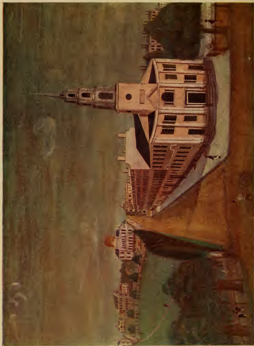
PARK STREET CHURCH AND PARK STREET ABOUT 1812

From a Fireboard in the Collections of the Bostonian Society