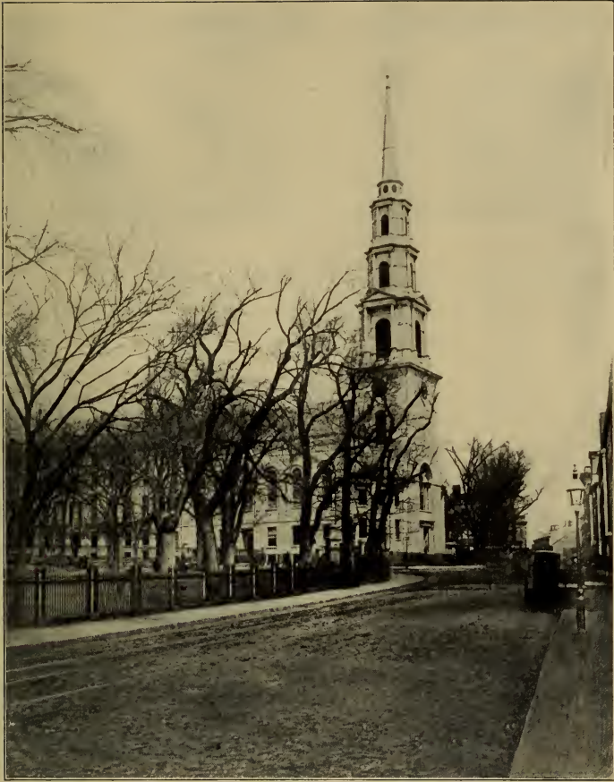
PARK STREET CHURCH Showing Fence and Sidewalk along the Common, Horse-Car Tracks in Tremont Street, and the Paddock Elms in front of the Granary Burying-Ground