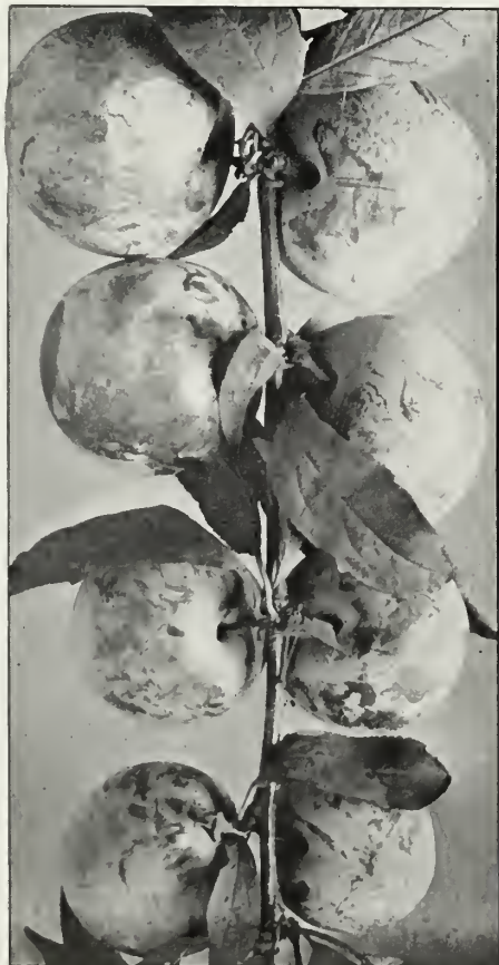
Early May Apricot

PLUMS—Other DESIRABLE VARIETIES IN MODERATE SUPPLY