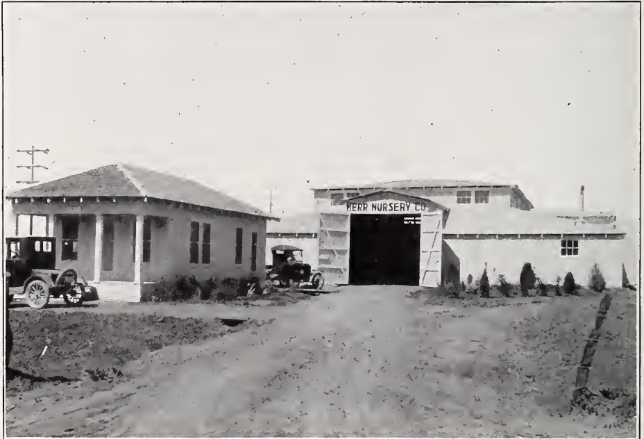
Our Office and Shed, Erected 1926.

We will observe, as far as possible, in filling orders the selections made by our customers, when practicable it is well to name second choice, or give us liberty to substitute similar varieties in case those selected are exhausted. All articles will be labeled with the true name. Selections left to our mature judgment in whole or in part, will have the benefit of our most careful filling.