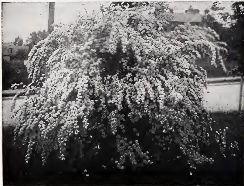
Spirea Van Houttei

Snowball, Japanese —A better bloomer and continues longer.