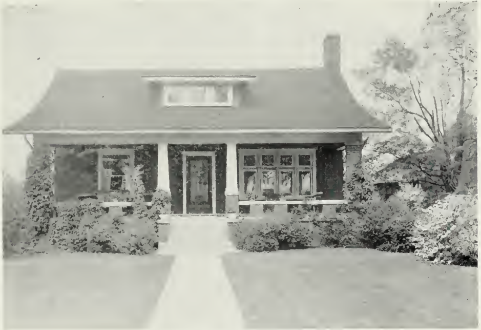
An Effective Base Planting with Open Lawn.