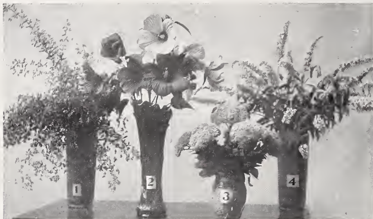
No. 1, Lespedeza