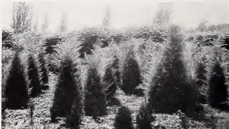
Pyramidal Red Cedar on Our Grounds