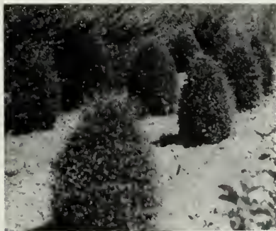
Ligustrum Amurense (Sheared) Growing on Our Grounds.