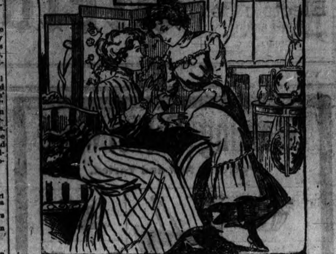
Picture Puzzle. Find grandma and her two pet cats.

SEASON CLOSING. Last Two Nights of the Douglas Summer Gardens Entertainments. The season of evening concerts at the Douglas gardens will close on Saturday night.